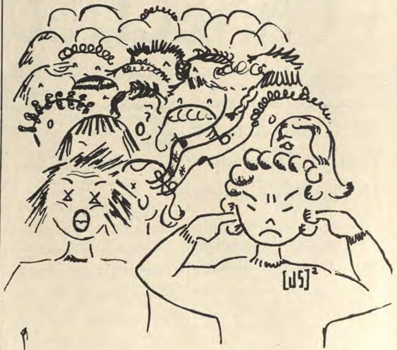
Competitive Sing-Some of us are talented