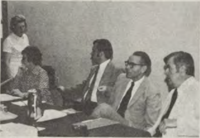
Saturday morning panel discussion, "Connecticut College Today"