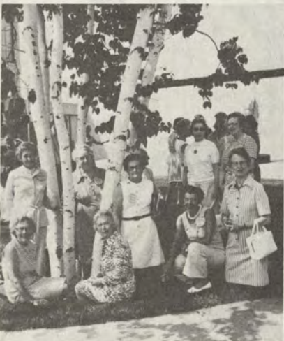
Class of '31, cool as cucumbers in spite of the heat