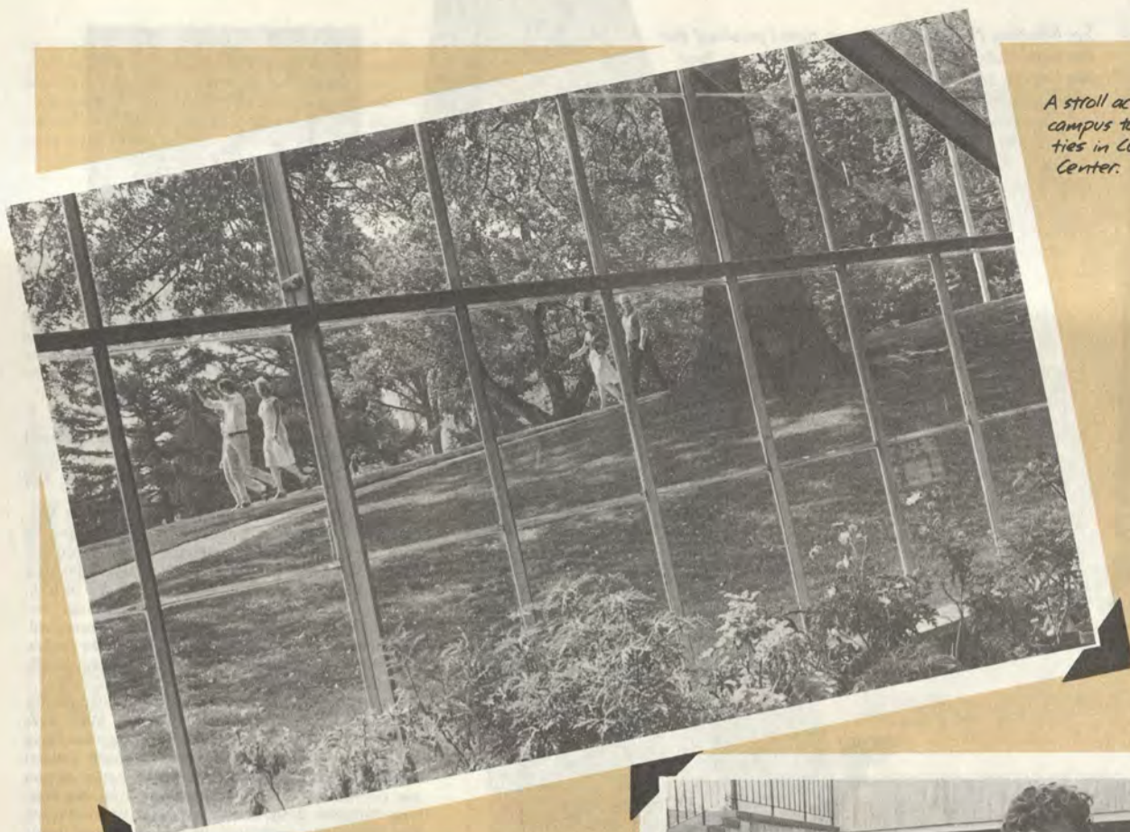
A stroll across a beautiful campus to Reunion activities in Cummings Arts Center.