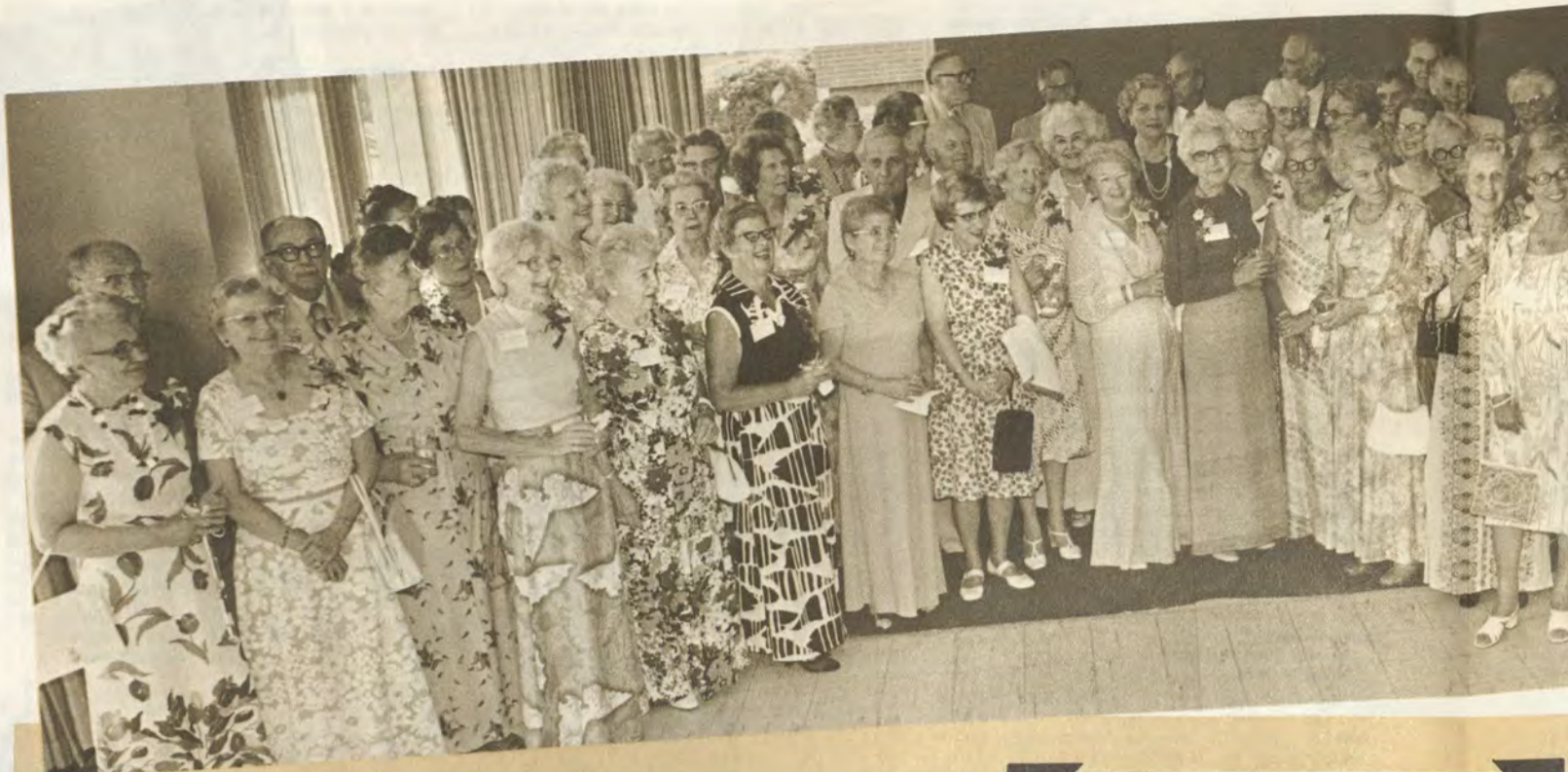
The Class of 1927's huge fiftieth reunion delegation gathered for this portrait before it's class dinner Saturday night.