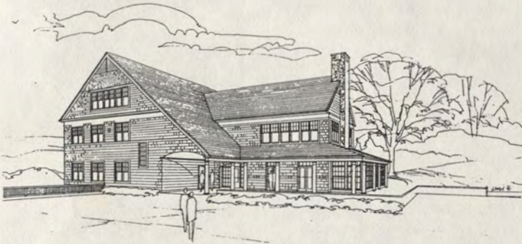
Artist's conception of Becker House/ Lloyd, Roth, and Moore, architects

The recommended dissolution of the Fund would require an amendment to the Association's Bylaws. Any change in the Bylaws requires approval by the entire association. Therefore, the question will be included on the April ballot along with the names of the Executive Board's nominees for elective office.