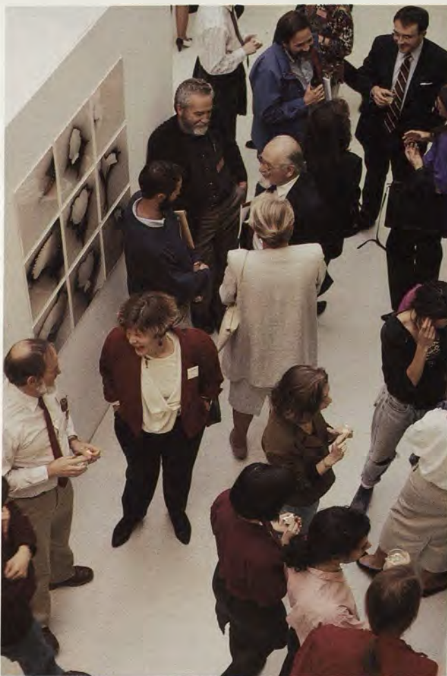
The opening reception for the new Center for Arts and Technology at Connecticut College was attended by faculty fellows and community partners.

"Technology is the bridge between the arts and the sciences," asserts com-