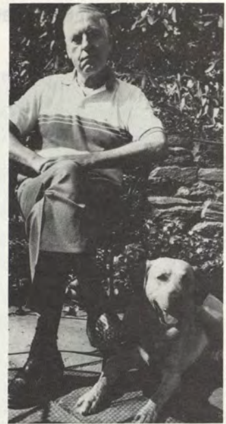
The poet and his dog, Mikey

From Partial Accounts: New and Selected Poems , published by Alfred A. Knopf. Reprinted with permission.