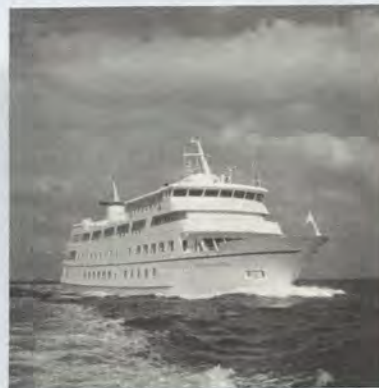
The Yorktown Clipper

The Alumni Association and the Mystic Marinelife Aquarium have planned this cruise to give you a close-up perspective of America's Last Frontier. Aboard the 138-passenger Yorktown Clipper you will be taken to wilderness areas where large ships cannot navigate and to secluded places beyond the reach of ordinary travel. A leisurely itinerary will be followed through the Inside Passage, which rivals the Norwegian fjords for pristine waters and mountain vistas.