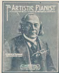
VLADIMIR DE PACHMANN