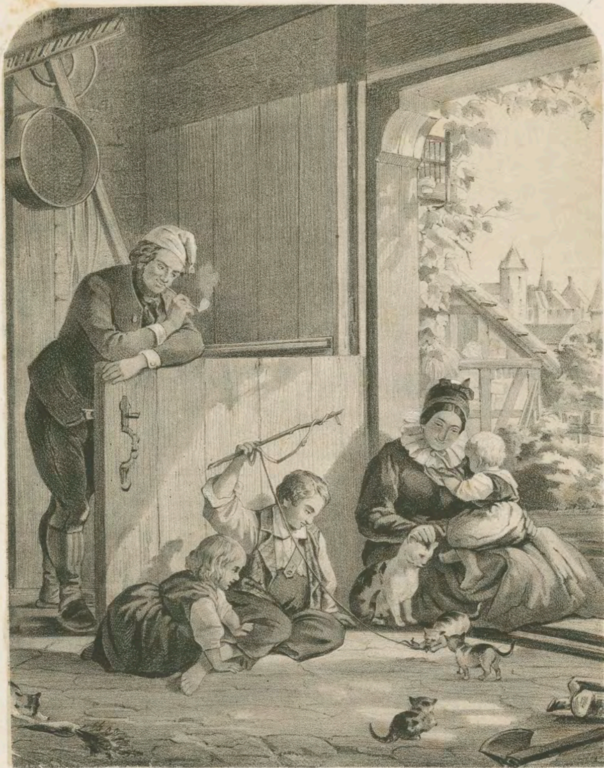
T Sinclair's Lith.