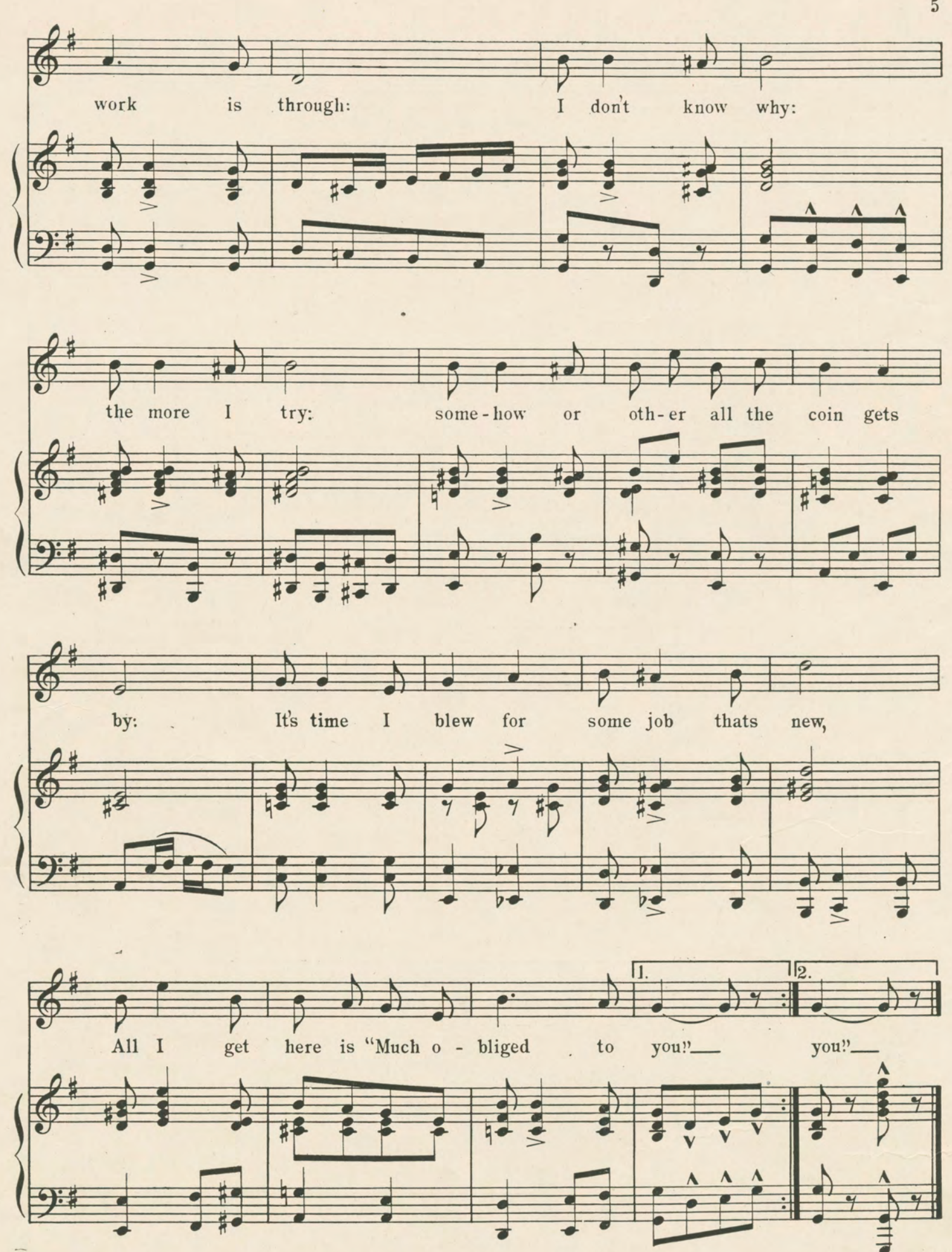
Much obliged to you. 4