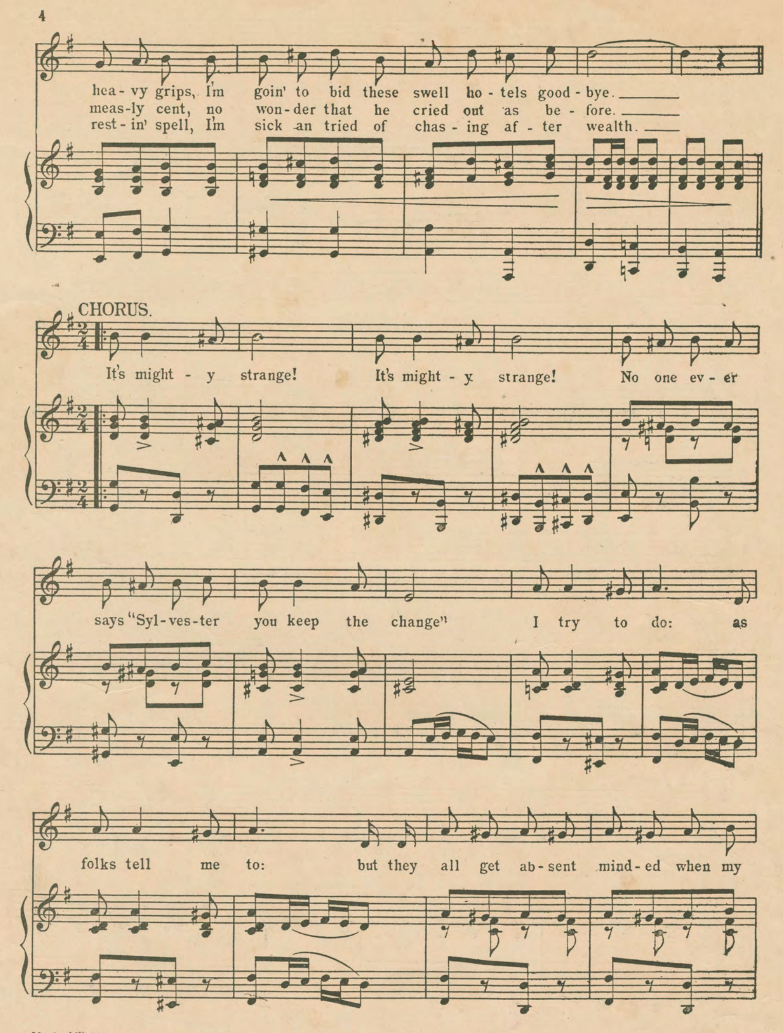
Much obliged to you. 4