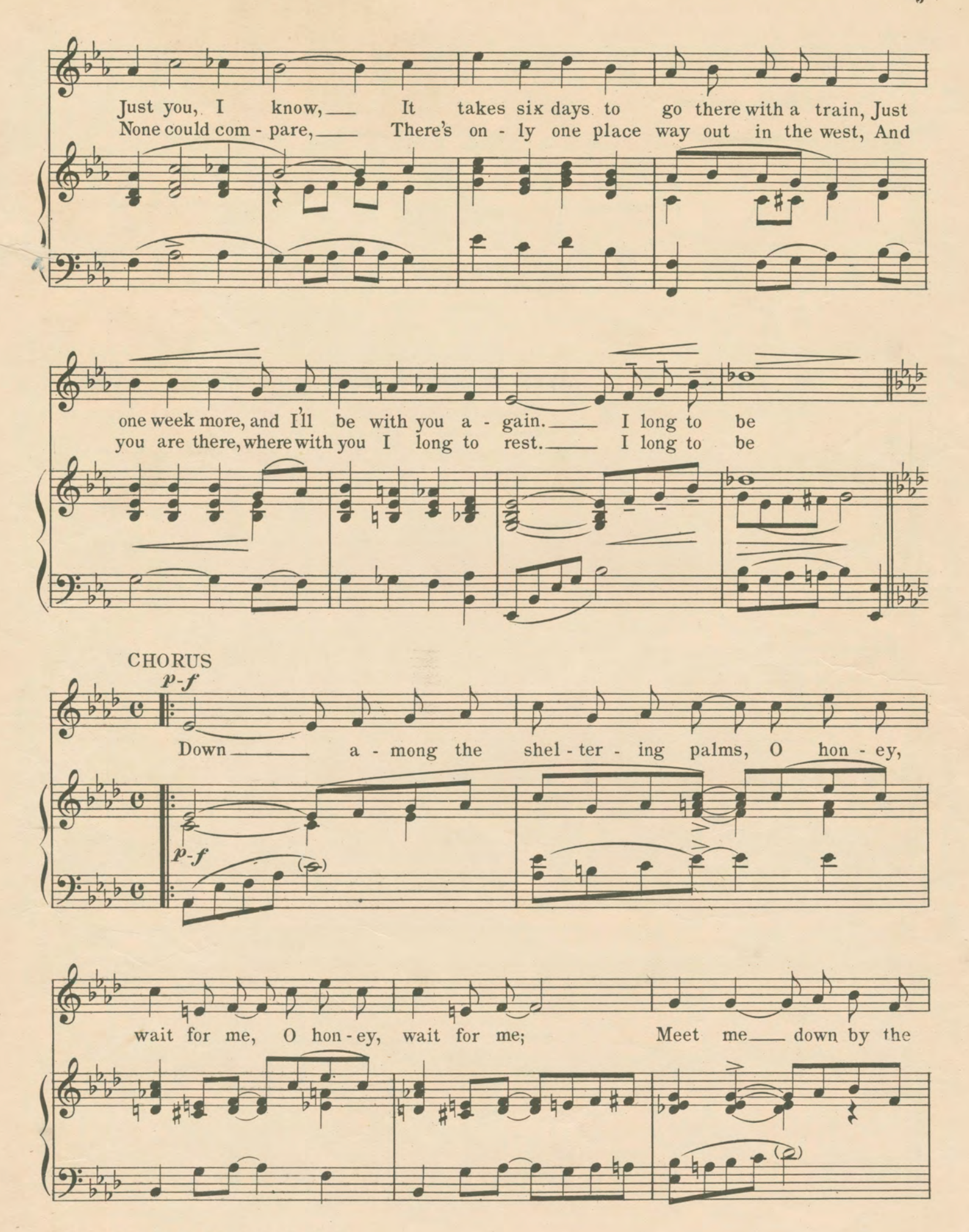
3236_3 Down among the sheltering Palms