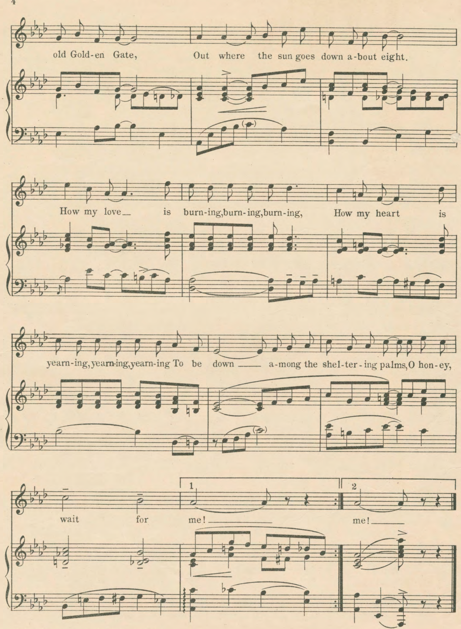
3236_3 Down among the sheltering Palms