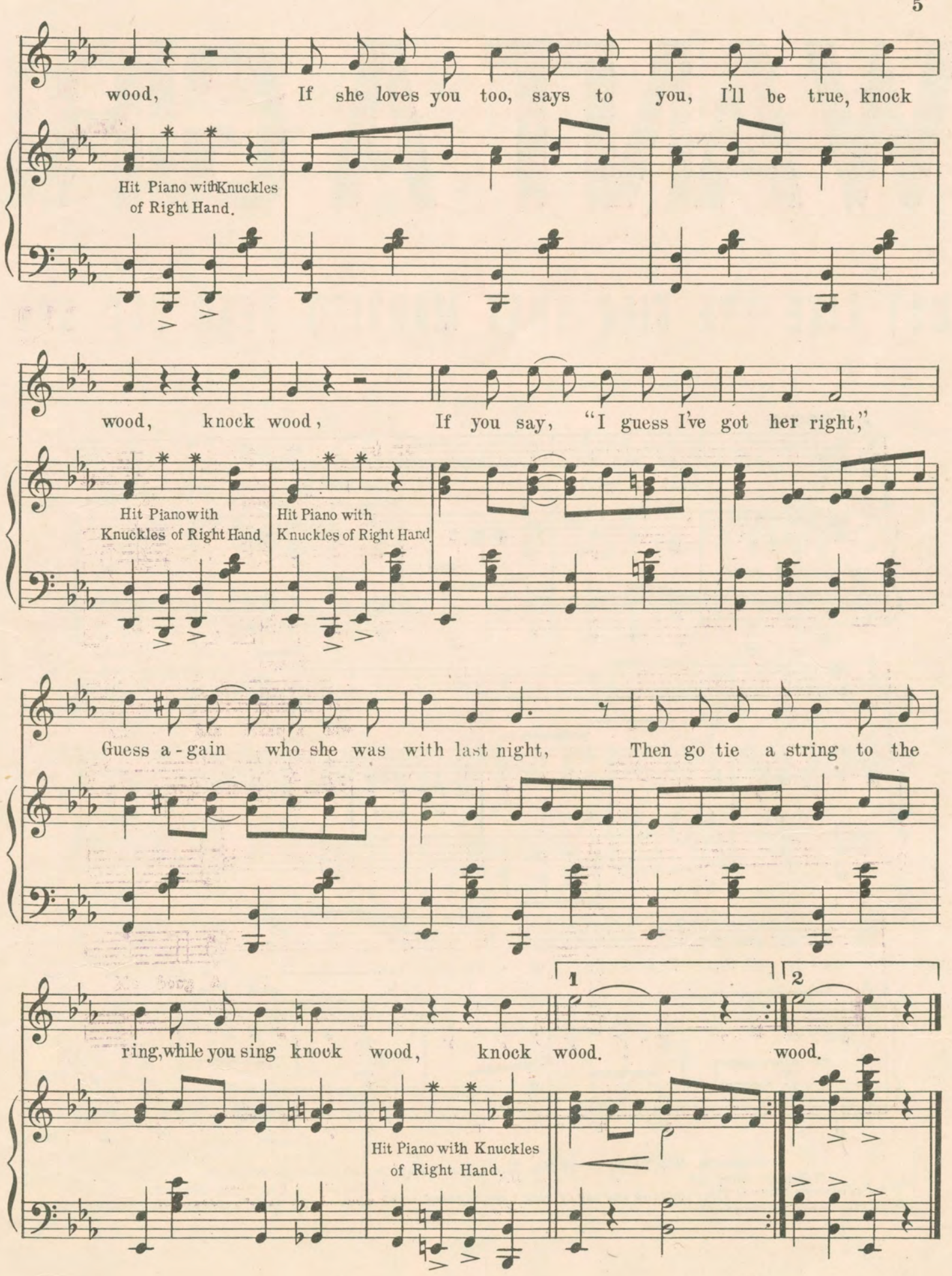
Knock Wood. 3