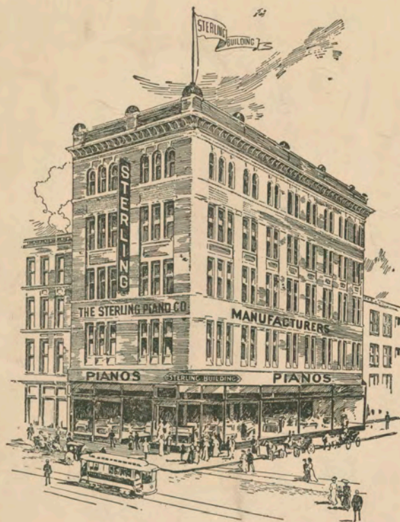
The STERLING Building Six floors. Owned and occupied exclusively by the STERLING PIANO CO.

The Largest Wholesale and Retail Piano Business in Greater New York