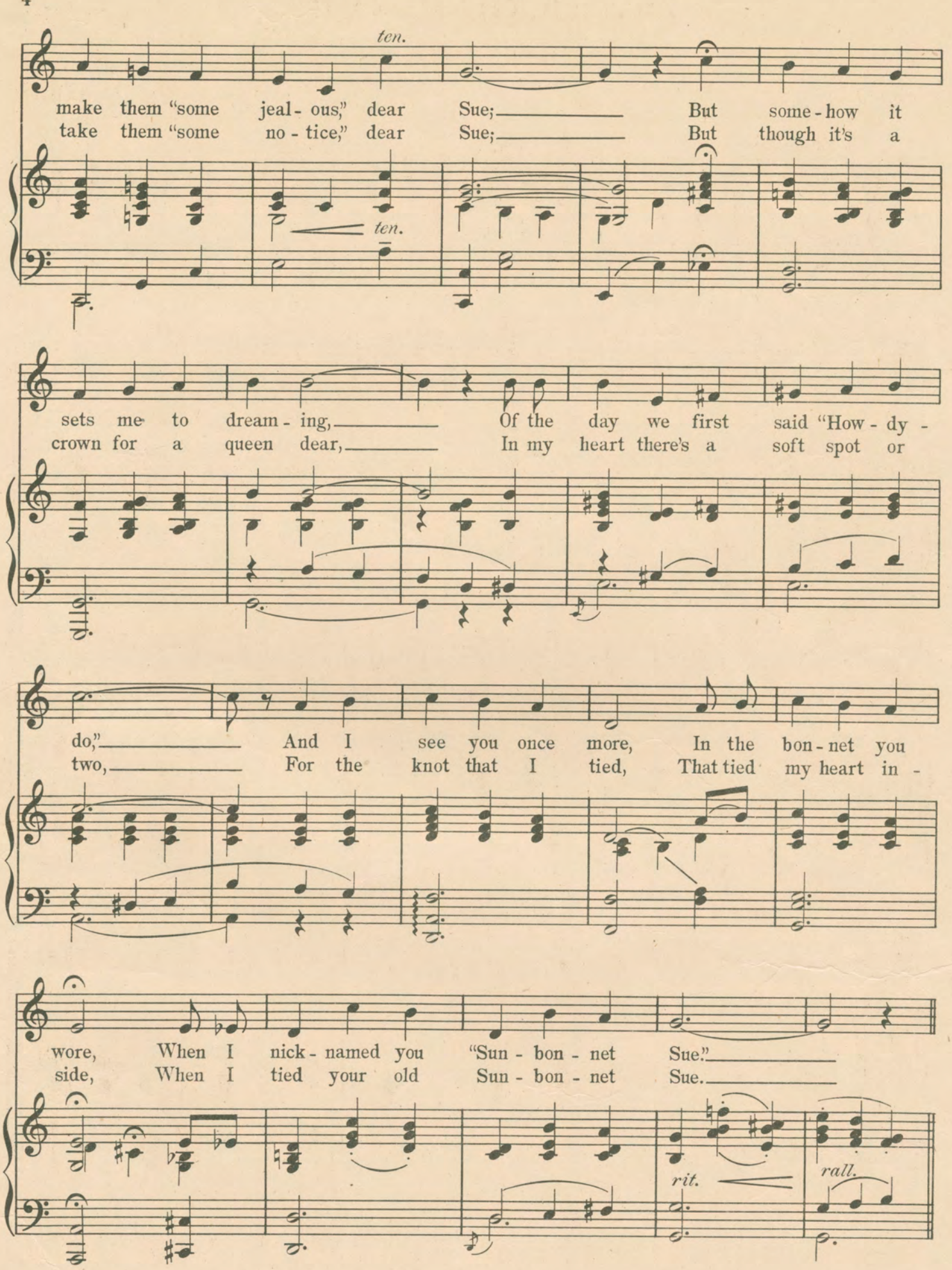
Sunbonnet Sue. 3