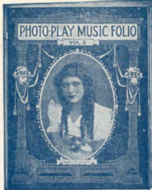
Photo-Play Music Folio

CONTENTS Vol. I. Selections From "Carmen" by Bizet "Faust" by Gounod "Aida" by Verdi "Bohemian Girl" by Balfe Volumes 1, 2 and 3 now ready