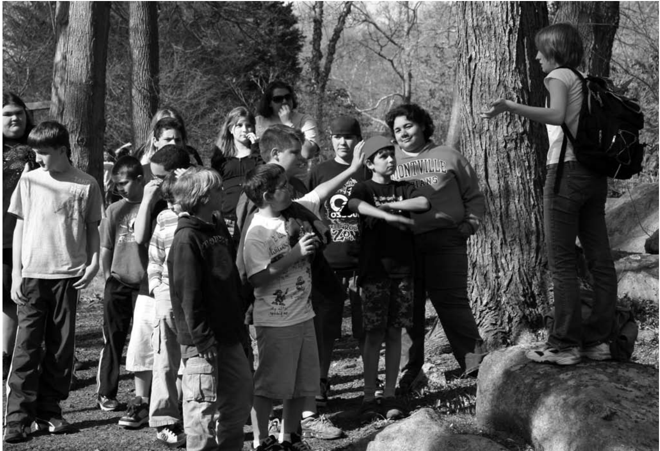
An Arbo Project tour in the Edgerton and Stengel Wildflower Garden.