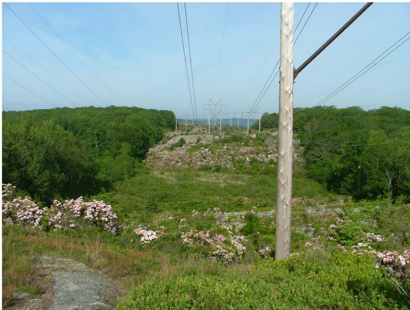
Figure 1. Powerline corridor managed by selective removal of trees to maintain low vegetation in Montville, Connecticut, U.S. doi:10.1371/journal.pone.0031520.g001

We located 55 prairie warbler nests during the summers of 2003, 2006 and 2007. Twenty-one field sparrow and nine eastern towhee nests were located in 2006–2007. For prairie warblers, the estimated probability of a nest surviving from laying through