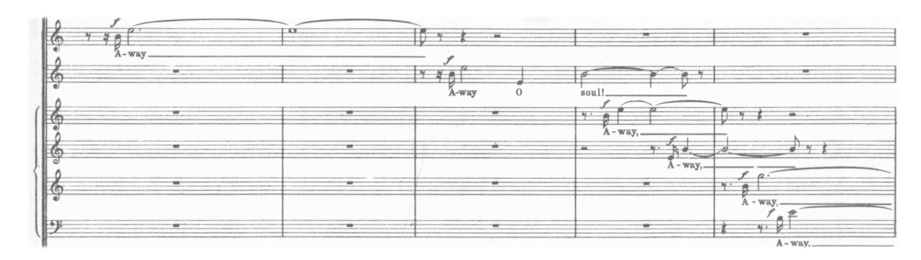
From the Stainer & Bell score, mm. 404-408: choral shouts of "Away..."

Whether or not the optional cut is made—and we can safely assume that the cut will not be made in any serious performance—the sudden shift from Lento to Allegro is a change from a beat on the half note, marked at 60bpm, to a beat on the quarter, marked at 160bpm. Without being able to see the change in the conductor, the listener does not immediately know that the tempo has changed so drastically, since the orchestra is playing only a tremolo on a D minor triad. Our first clue is the soprano soloist, who sings "Away...," followed immediately by a glissando in the harps and an embellished quarter-note motive in the violins and violas. A measure later, the baritone chimes in with "Away...," followed at increasingly quick intervals by the choral parts: