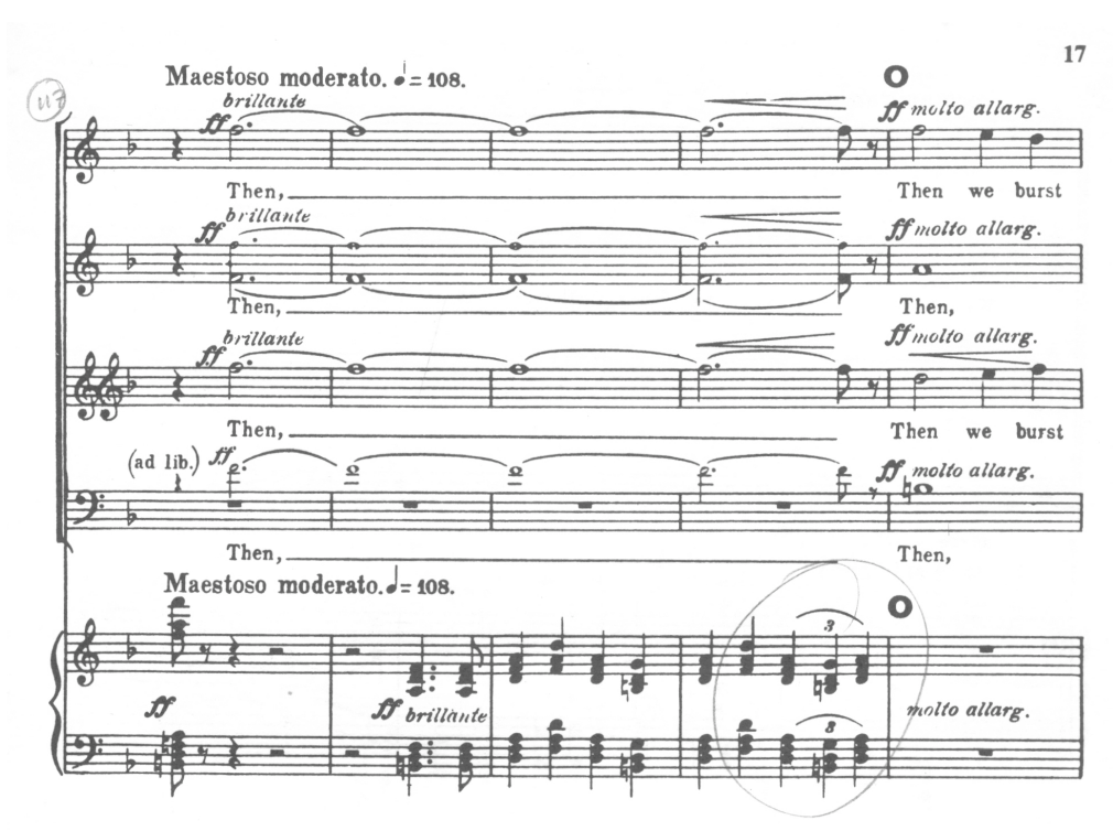
From the Stainer & Bell piano-vocal score, mm. 117-121.

voices. This text, like the Milton, has a clear climactic moment, at the line "Then we burst forth—we float / In Time and Space, O Soul." After each voice takes its turn singing the word "then," finally building a D major triad with the orchestra, the key signature changes back to F major. The choir sings "Then" together on two octaves of F, the basses and altos stretching up to the top of their registers, over four measures while the orchestra restates the theme that becomes the main theme of the rest of the work: