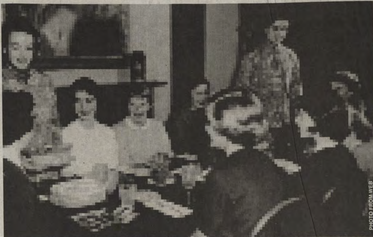
1952. Dining in Mary Harkness House dining room

People, such as Cady from Mean Girls , who don’t choose to dress like “a total slut” at a Duke frat party should not be marginalized in social situations. I have female friends on campus who feel uncomfortable going to the dances because they do not wish to dress down and they do not want to be socially ostracized. These friends, all of whom wished to remain anonymous, were forced to settle for a quiet movie night with friends, instead of the excitement of the Halloween dance. They admit they still had fun, but they were disappointed that they felt excluded from the soiree. It is disappointing that conversations about such a fundamental right to free expression are still being debated in the twenty-first century. If we’re ever going to continue moving toward the goal of gender equality, then we will have to understand that different people dress differently – and there’s nothing wrong with that. •