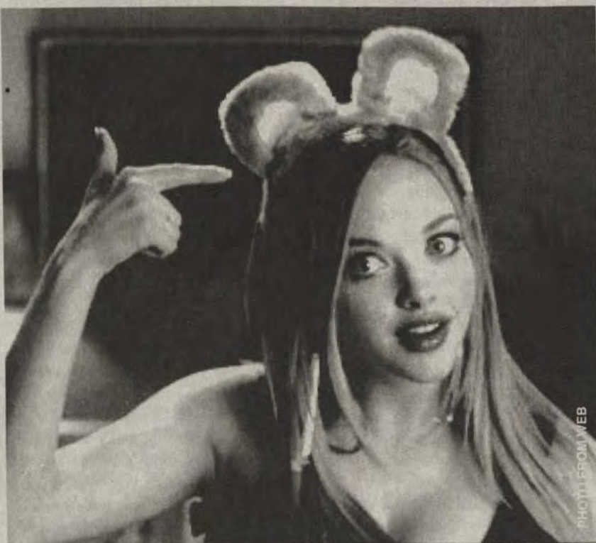
FREDERICK MCNULTY CONTRIBUTOR

As one might expect, the dances at Connecticut College are events where students exude sex appeal in ways they are unable to elsewhere. The outfits at the recent Halloween dance were no exception. Many of the female students wore short, skimpy and sensual costumes – if these excuses to wear as little as possible can still be classified as “costumes,” that is. I don’t have a problem with women choosing to wear what they please; in fact, I would argue that having the freedom to dress as oneself is a right. These outfits may make a few students uncomfortable, but this discomfort is merely another aspect of living in a diverse community: you have to accept other people’s choices. As these women will tell you, they choose to wear these outfits. But are women truly afforded the choice of how to dress?