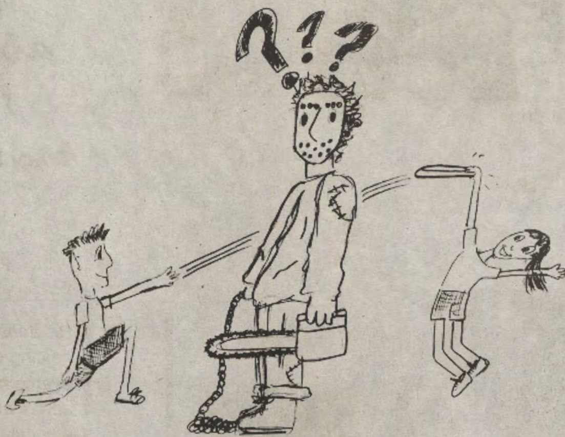
Jason Voorhees clearly seems to have misinterpreted the meaning of Connecticut Hammer Massacre.

We should offer more support to the people who win sports glory for the school. If anyone is good with public relations and is looking for an outlet for their talents, I hear the team is looking for someone capable of promoting the team in a positive way, one that doesn't make them sound like murderers or construction workers. •