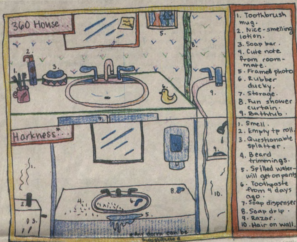
The differences in living in alternative and regular housing, bathroom-wise.