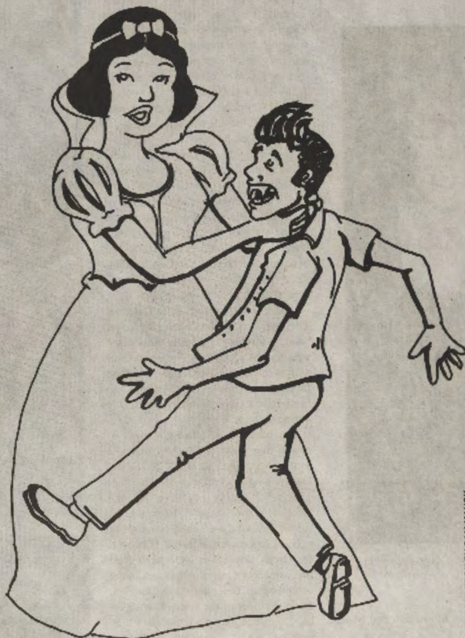
Snow White chokes Edward Cullen, a perfect allegory for the gradual decline of the vampire flick and the resurgence of fairytales in Hollywood cinema.

ABC's Once Upon a Time (Sundays at 8 PM) traps such iconic characters as Snow White, Prince Charming and Rumplestiltskin in modern-day reality, described as "someplace horrible" with no happy endings. Since the show comes from the writers of Lost , viewers know already that nothing (and I mean nothing ) will be as