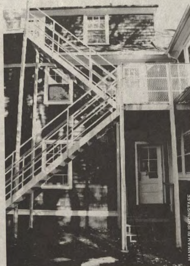
The 360 Apartments, today.

local foods section. In considering why students are so eager to move a longer walk or sometimes a drive away from campus, I assumed they were seeking freedom: freedom to eat and do what they wanted.