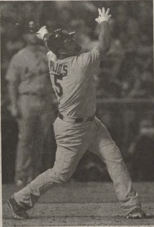
Albert Pujols' three home runs helped the Cardinals take game three in Texas and ultimately the series.

If not, here are a few more reasons. There are a handful of players who made a name for themselves in the 2011 Postseason and particularly in the World Series. Most noteworthy are David Freese of the Cardinals and Mike Napoli of the Rangers. The