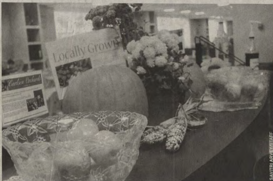
MOLLY BIENSTOCK CONTRIBUTOR

Last year, Harris added a new extension to its salad bar: the locally grown section. In addition to the dining hall's modern new look, Harris now allows environmentally conscious and curious students to try produce that is grown in New England and the tri-state area.