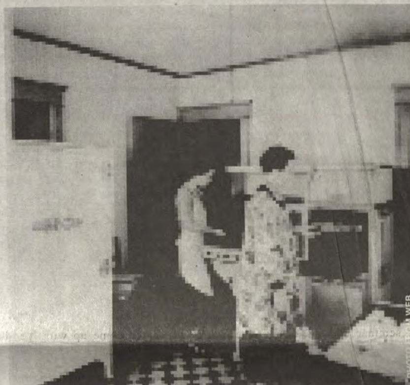
Students prepare a luncheon in [the] kitchen of Mosier House, one of the former off-campus housing options.

It appears that this year specialty-housing options have become more and more attractive to students—scores of students have hounded my roommates and I for our application secrets. Our theme was sustainable food; a topic so ubiquitous presently that even Harris has embraced it with its short-lived