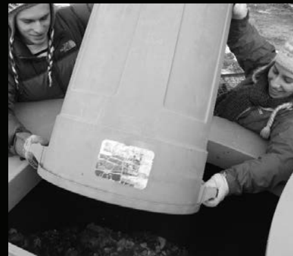
Left to Right, Top to Bottom: