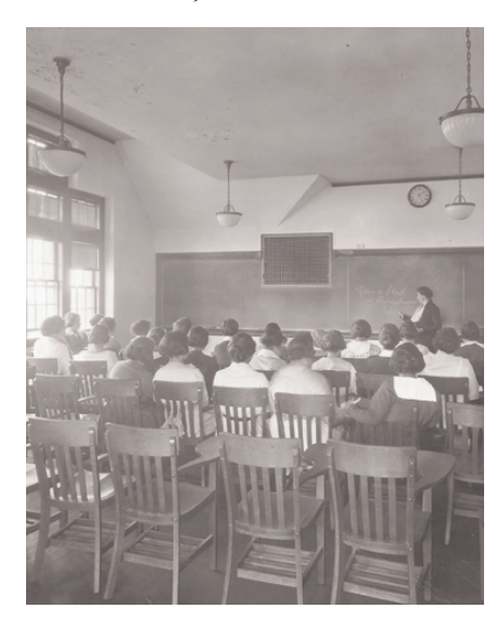
New London Hall in 1920

Connecticut College is that of remodeling our classrooms to be modern, effective and