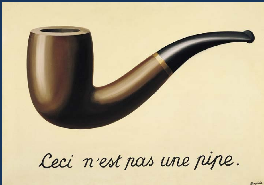
René Magritte This is not a pipe (1936)