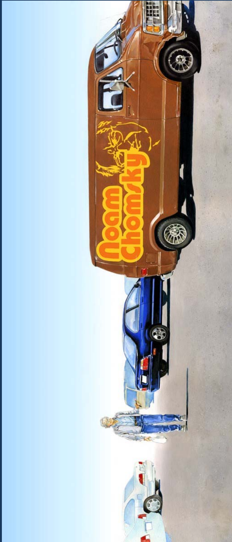
Brandon Bird Signifier and Signified (2006)