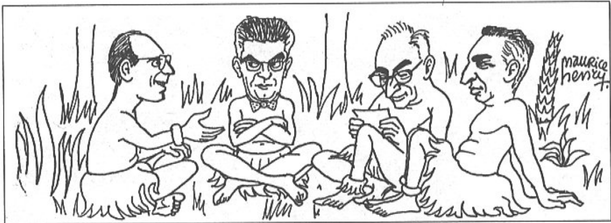
Cartoon by Maurice Henry, published in La Quinzaine Litteraire , 1 July 1967.

Spring 2015, Wednesday/Friday 2:45-4:00 Olin 113