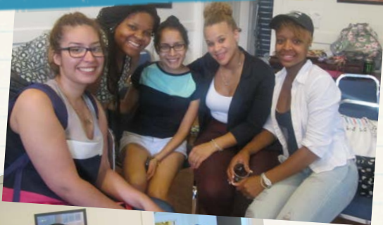
WELCOME BACK BBQ