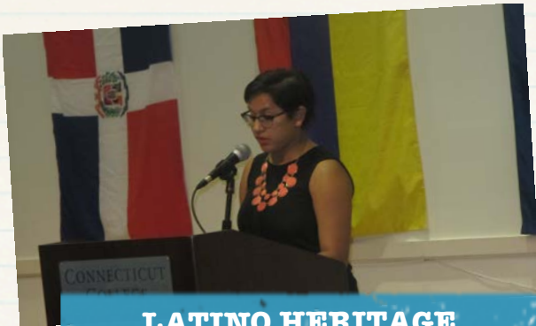
LATINO HERITAGE MONTH CONVOCATION