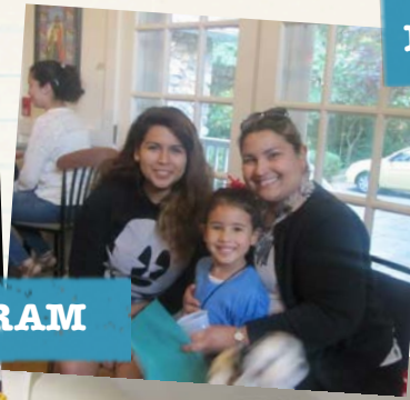
DIVERSITY PEER EDUCATORS