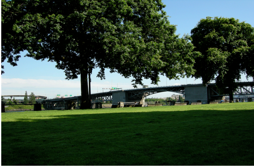
Figure 6: Waterfront Park, Southwest Portland

Waterfront Park was usually my first destination of the day. Here, crowds of street kids sprawled on the lawn. I became familiar with one group in particular, and could typically find any number of them in the park by mid afternoon. Many lounged on person-sized backpacks, making their status as travelers obvious. Unlike other groups in the park, the circles of street kids were consistently large in number. Street kids are often more boisterous than other park-goers, uninhibited by the norms of public spaces. Mild afternoons were spent among these throngs of street kids and travelers. I played guitar and watched the activities unfold around me. Like other young people, they drank and smoked cigarettes, passed the occasional joint, and laughed a lot. Some played guitar, either using their own, or asking to play mine. In the same way that Taylor and Hickey (2001) used a video camera to facilitate conversations between themselves and the cholos of Barrio Libre, I used my guitar as my “in,” a symbol of freedom and individuality. My guitar was the cornerstone for building rapport with individuals, and a small but durable connection to street kid subculture (Taylor and Hickey, 2001).