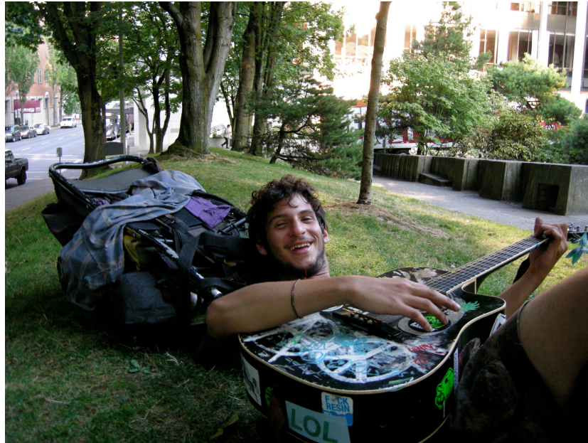
Figure 10: A traveler relaxes at Keller Fountain

There is a notable overlap between methods of subsistence and having fun. When they were not basking in the sun with dogs and guitars, street kids were spangeing or busking on downtown Portland streets. While both spangeing and busking are methods of resource allocation, they are simultaneously modes of entertainment. Spangeing with Providence and Moon Flame one afternoon, I offered them a bag of pennies I had uncovered in my apartment that morning. Instead of counting the pennies and using the money, Providence instructed us to help flip the pennies head's-side-up on the sidewalk in front of us. As pedestrians hurried passed, Providence asked, "Excuse me, do you need some luck today?" (de Lise, 7/26/12) It was games like these that earned him his name, Providence. Spangeing is meant to acquire resources, as well as a way to pass time, and maybe brighten someone's day.