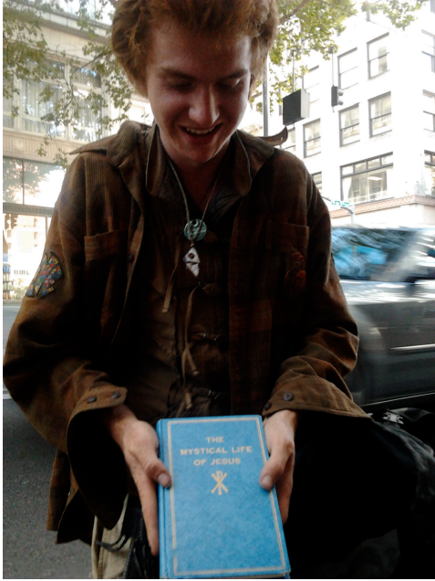
Figure 7: A traveler shows a book, “The Mystical Life of Jesus.”

During our second interview, North Star spoke of the differences between Eugene, Oregon, and Portland: