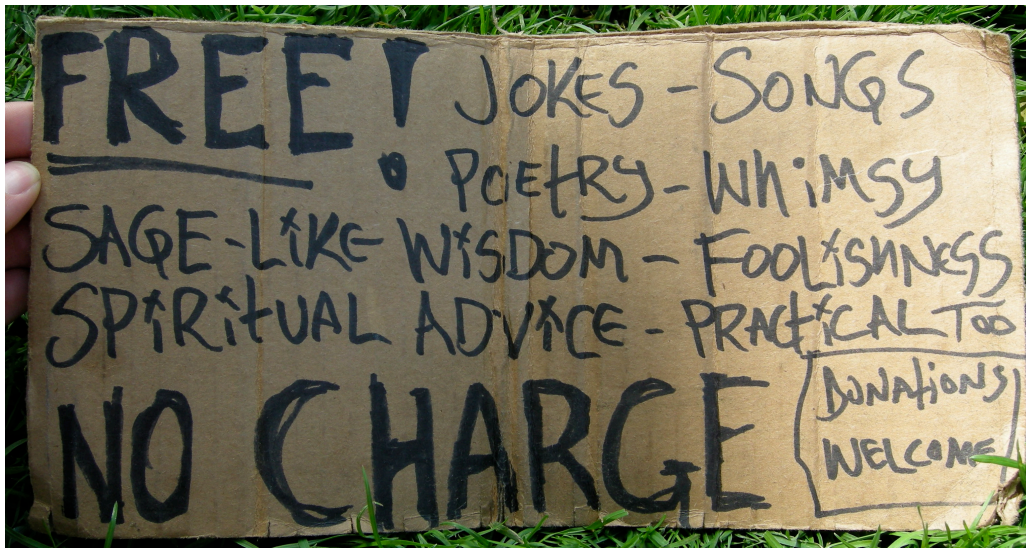
Figure 11: Spangeing sign meant to entice passersby and hopefully yield donations

North Star spoke about experiences busking in Portland, explaining that you need to entertain the public while performing; otherwise they will not pay any attention: