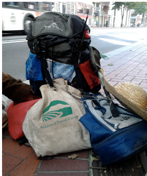
Figure 8: A street kid's traveling pack

Manifesting may also result from the power of human connection, no matter how fleeting, and its ability to make two strangers' stories, one narrative. On his first day in Portland, a traveler who was also a musician received $120 from a man in passing: the stranger's mother had just died, and the stranger was moved by the young man's music. A brief moment of interaction with a stranger is not always notable. Like the witchcraft of the Azande of north Central Africa, everyone is capable of manifesting, because it is entirely dependent on the will to