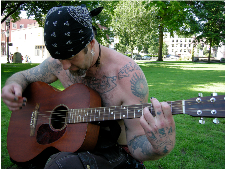
Figure 9: A street kid plays my guitar in Waterfront Park

Relaxation and play for street kids and travelers often means lounging outside with friends and enjoying the perfect Portland summer days and nights. During the day they spent most of their time at Waterfront Park, Keller Fountain, and the Occupy Portland encampment where they drank, smoked cigarettes and marijuana, played music, and played with dogs. If food was available, it was eaten and shared. Unfortunately, I was unable to conduct participant observation in the evenings, and so I cannot paint the full picture of street kid social activity.