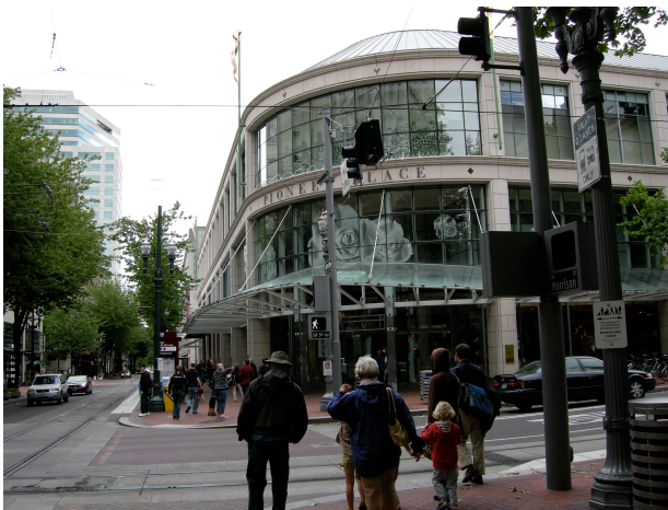
Figure 1: Pioneer Place Mall, Southwest Portland

Definition of a street kid is intentionally broad. Following Finkelstein (2005), Joniak (2008), Karabanow (2006), and Wilkinson (1987), I use the term “street kid” as a common identifier for the urban youth that are at the center of this study. Of course, this is how the street kids referred to themselves, but they also used “traveler” and I use both terms interchangeably. Use of these terms, within the context of in-depth interviews, helps to humanize street kids and dispel negative connotations (Karabanow, 2006).