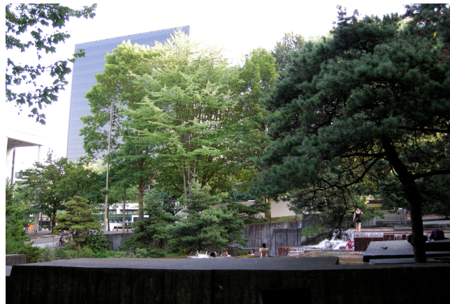
Figure 5: Keller Fountain, Southwest Portland

When I began fieldwork in Portland during Summer 2012, my guitar proved to be my most useful tool. I busked in downtown Portland nearly every day, playing guitar and singing for passersby. Most afternoons, I busked on street corners in areas with a lot of foot traffic, on the southwest, or downtown, side of the city. I was able to observe my surroundings in an inconspicuous manner, taking note of young people traveling in groups, carrying large packs, or carrying cardboard signs for panhandling. I began to approach street kids and travelers, expressing my interest in learning more about their lifestyle. Some of these conversations developed into structured interviews, which I recorded with their permission, using a digital audio recorder. Interviews occurred on downtown sidewalks or in Waterfront Park. I was participant and observer, and recorded notes at the end of each day. Participant observation was conducted almost exclusively in southwest Portland, namely at Waterfront Park and Pioneer Place.