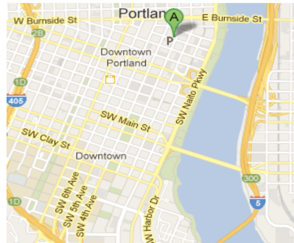
Figures 2 and 3: Geographical location of Portland, OR in the U.S. and Southwest Portland, OR

Portland, Oregon, is commonly known as the city where young people go to retire. It is a place known for its quirkiness. From naked bike rides to dodge ball in the park to street performers on every corner, Portland is cultivating a reputation as a place for freedom of expression and acceptance. As a young musician, I was told that Portland is the place to be; unlike music scenes in other cities, Portland's music scene is known to be one of welcome and support. There are numerous successful musicians and bands that began in Portland, adding to the city's allure. With this in mind, I drove across the United States, ready to delve into the music community and see whether the rumors were true.