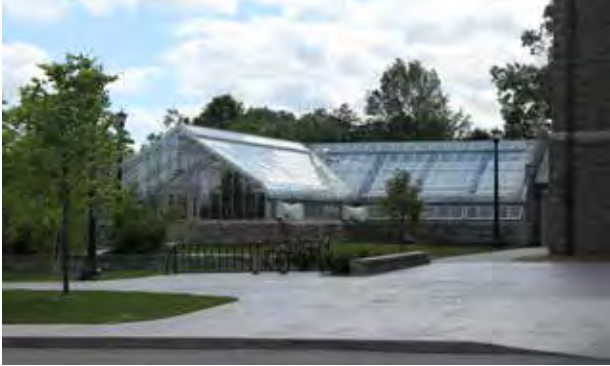
Top: Superstorm Sandy damage to white pines in the northeast corner of the Native Plant Collection; Bottom: Centennial Plaza and the modernized greenhouse south of New London Hall

As part of campus wide sustainability planning the Arboretum staff updated our detailed Plant Collections Policy, revisited the Invasive Plant Management Policy and began documentation of our maintenance procedures for turf, woody plants, management areas and the greenhouse.