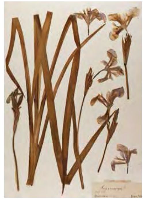
Opposite page: A temporary student environmental art installation near the Edgerton and Stengel Wildflower Garden Entrance; Top left: An herbarium specimen of Blue Flag Iris collected in 1882, housed in the CB Graves Herbarium, and scanned for the Fall 2012 art exhibit "Systema Naturae: The Order of Nature."; Top right: A partially impounded tidal marsh at Barn Island Wildlife Management Area, part of the Arboretum management plan project. Bottom right: SODAR unit being installed in Arboretum north of Gallows Lane to record wind speeds for wind turbine feasibility study.