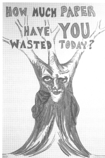
Tree by Bridget Pupillo