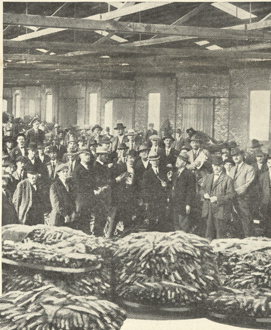
Tobacco being sold at auction on a Southern market.

Chesterfield ages these tobaccos for 30 months — 2½ years — to make sure that they are milder and taste better.