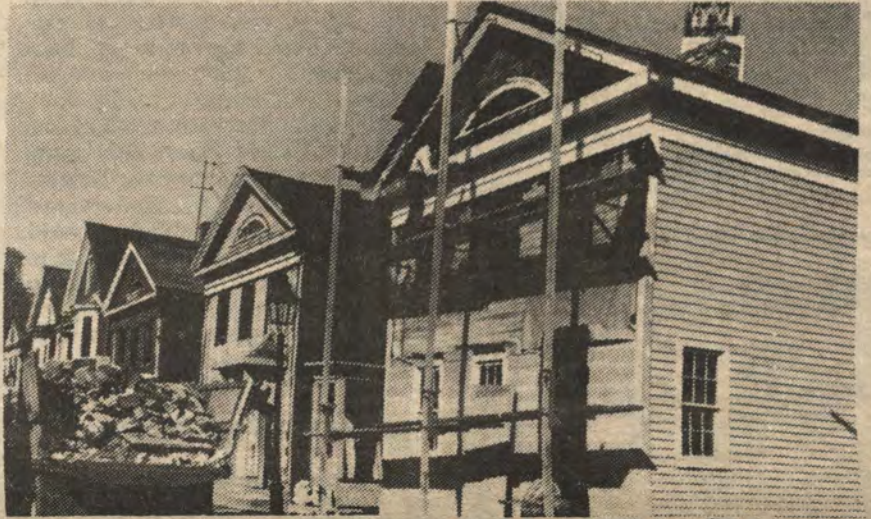
Work in progress on the Starr Street renovation project.