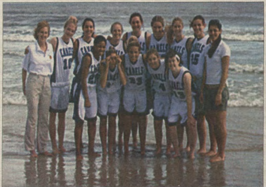
Courtside to Seaside (Web)

The team has set many goals for itself—both on and off the court. In order to achieve them, the girls must maintain a high level of intensity during practice. They