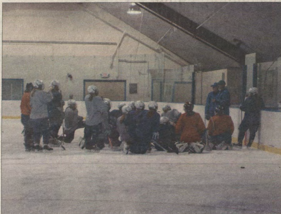
Women's Hockey gearing up for a double-header this week (Schuerhoff '10)

LECTURE Following in the footsteps of Dinosaurs: The Age of Dinosaurs in the Connecticut Valley 7:00 PM New London Hall, Room 110