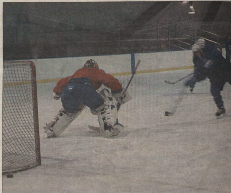
Don't miss Women's Hockey at Dayton Arena this week

EVENT WINTER FORMAL 10:00 PM Crozier-Williams Student Center