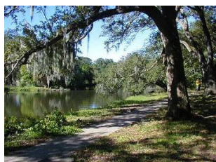
New Orleans City Park