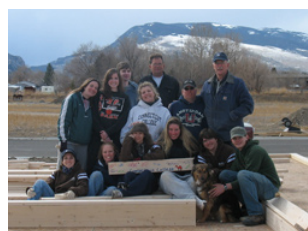
Habitat for Hum. in Cody, Wyo.

This spring break Connecticut College students will engage in at least four different alternative learning/service spring break projects, spanning the country and the globe, from Alabama to Africa. Students working with Habitat for Humanity will be building houses in both Alabama and Pennsylvania. In New Orleans, a student-organized project will focus on restoring and maintaining the largest public park in the city in hopes of creating safe and appealing green space for everyone. A student working with Asayo's Wish Foundation will help bring much needed medical supplies and work with children at an orphanage in Kaberamaido, Uganda. If opportunities such as these interest you, contact OVCS (x2958) for more information about the trip leaders and to connect with an institutional committee exploring ways to solidify all break programs.