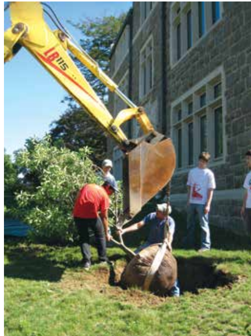
TOP: A FRANKLIN TREE WAS PLANTED ON THE WEST SIDE OF NEW LONDON HALL TO REPLACE ONE THAT WAS DAMAGED DURING THE BUILDING'S RECENT RENOVATIONS.

house that had to be removed due to recent greenhouse and New London Hall renovations. The vision was to create gardens that are attractive year-round, with an emphasis on plant diversity during early spring and fall, when classes are in session. The plantings were also designed to serve as a pollinator garden, and high diversity of floral types was achieved with