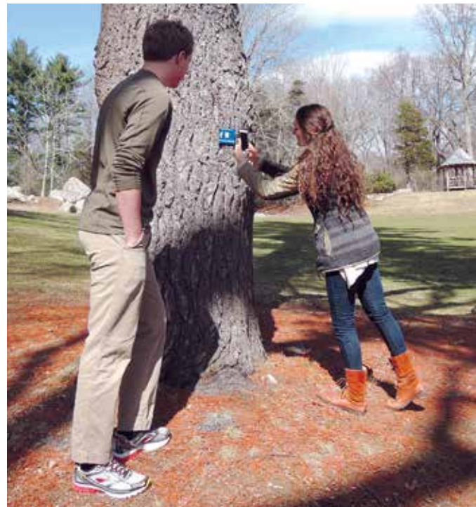
RIGHT: STUDENTS SCAN A CAMEL TOURS QR CODE ON A SIGN IN THE ARBORETUM OUTDOOR THEATER.

THE ARBORETUM BECAME the prototype of a new kind of self-guided tour that uses mobile technology to allow visitors to listen to short audio explanations and view images of particular locations. Various places, like the main entrance and Buck Lodge, have simple signs with QR (Quick Response) Codes that can be scanned with a smart phone or similar device to bring up files that are viewed and listened to with any web browser. The tour can be pre-downloaded (and viewed) at any time, and thus a mobile datalink is not required at the actual tour location. This project emerged from a marriage of the technical and design-based expertise of computer science with the goals of community-based anthropology at Connecticut College. Team members include Christine Chung, Jean C. Tempel '65 Assistant Professor of Computer Science; Anthony P. Graesch, associate professor and chair of anthropology and the following computer science majors: Jennifer Blagg '13; Amit Kinha '14; Dillon Kerr '15; Julia Proft '16; Virginia Gresham '17.