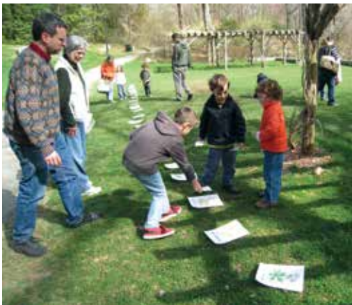
LEFT: A CHILDREN'S WILDFLOWER WORKSHOP IN THE OUTDOOR THEATER