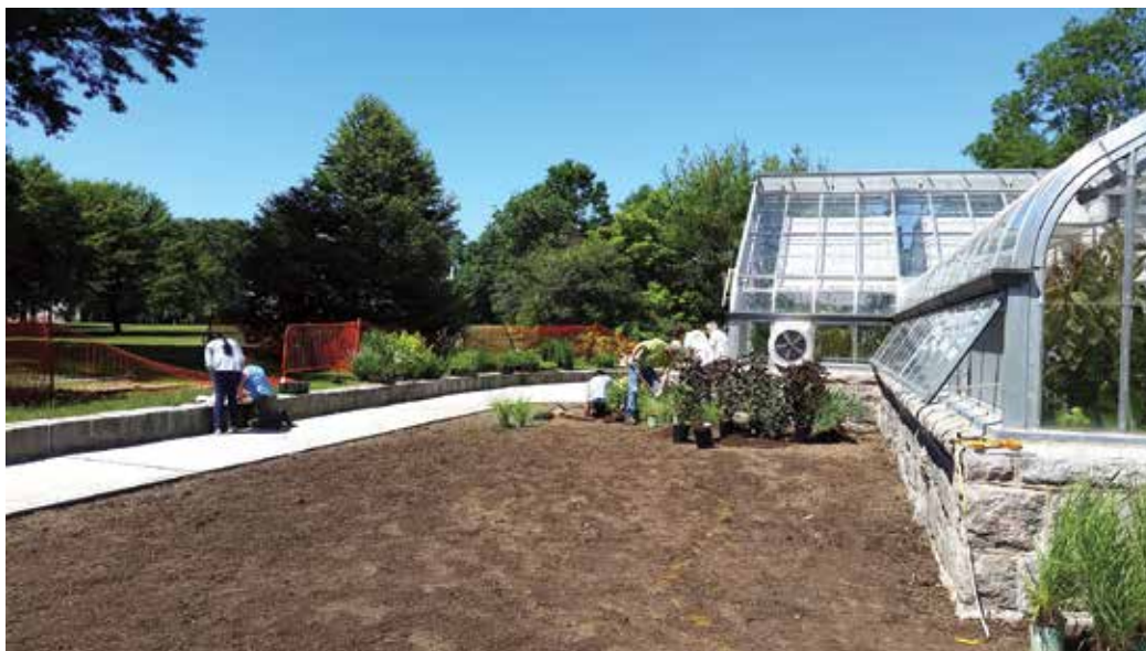
BOTTOM: ARBORETUM STAFF AND SUMMER WORKERS INSTALLING PERENNIAL GARDEN ON THE SOUTH SIDE OF THE COLLEGE GREENHOUSE.