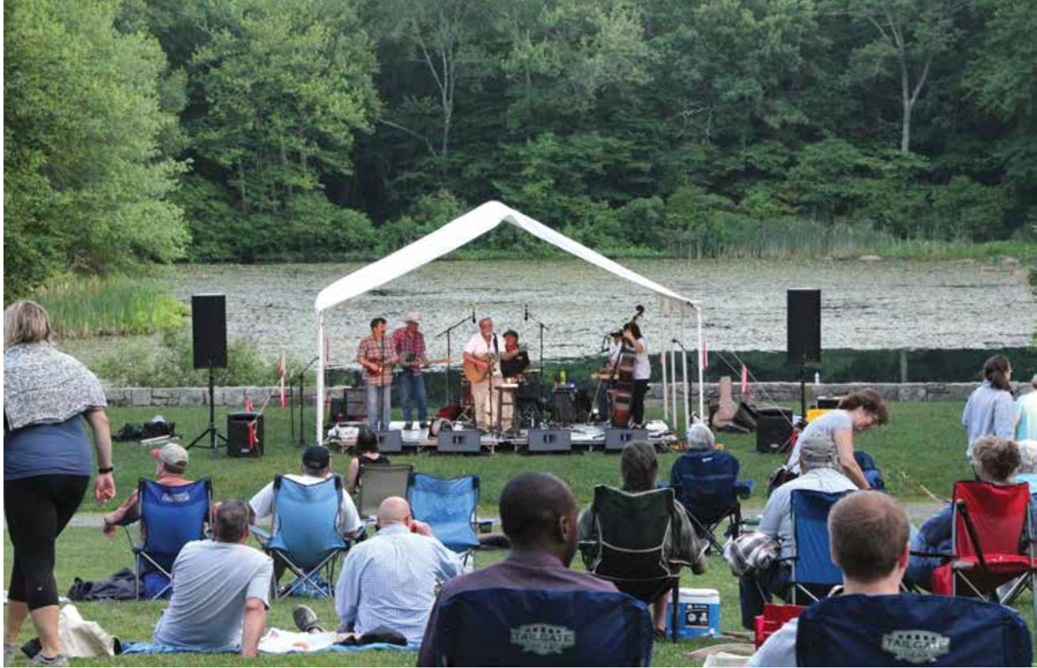
HELLBENT & HEARTBREAKIN' PERFORM IN THE OUTDOOR THEATER FOR MUSIC IN THE MEADOW 2015.