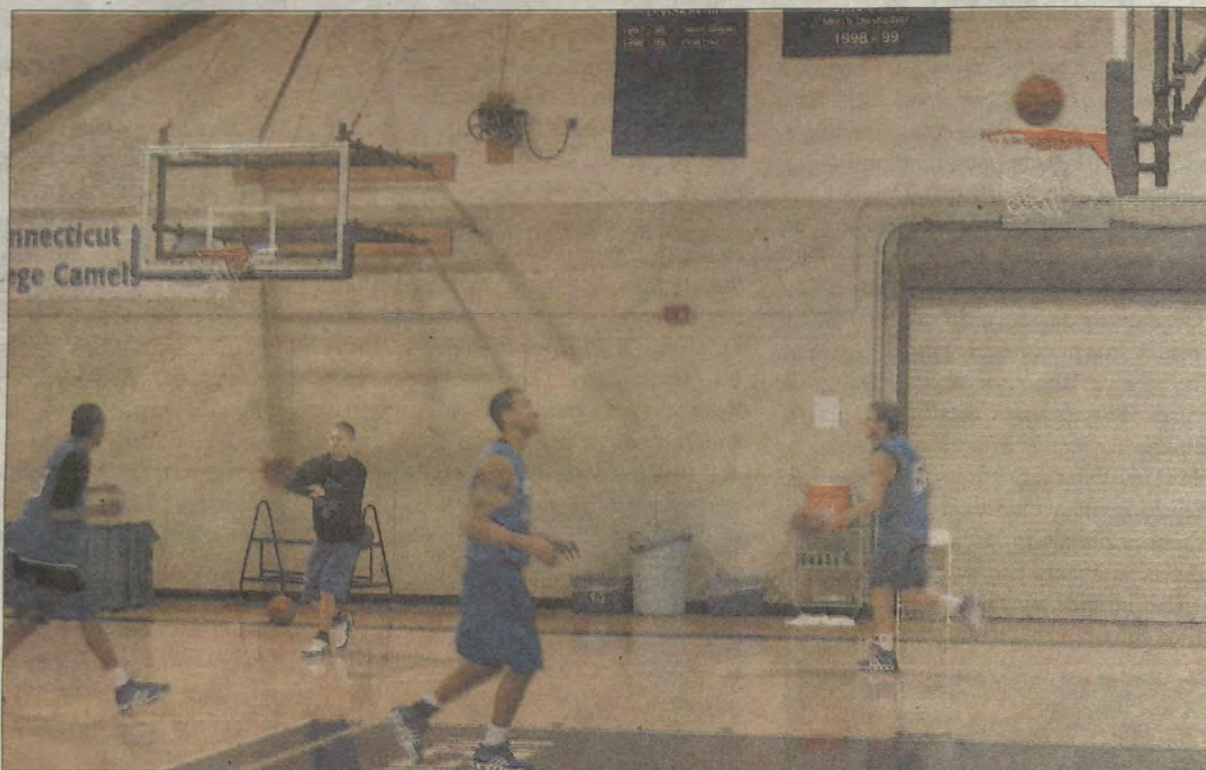
Men's Basketball hitting the hardwood

Now sitting at 14-3 overall and 2-1 in NESCAC play, the Camels have already won more games than they have in the last five years. They travel to Tufts and Bates this weekend and look for conference victories four and five. Currently ranked fourth in the NESCAC, plenty of eyes will be on the Camels this weekend to see if they can keep their spectacular season rolling