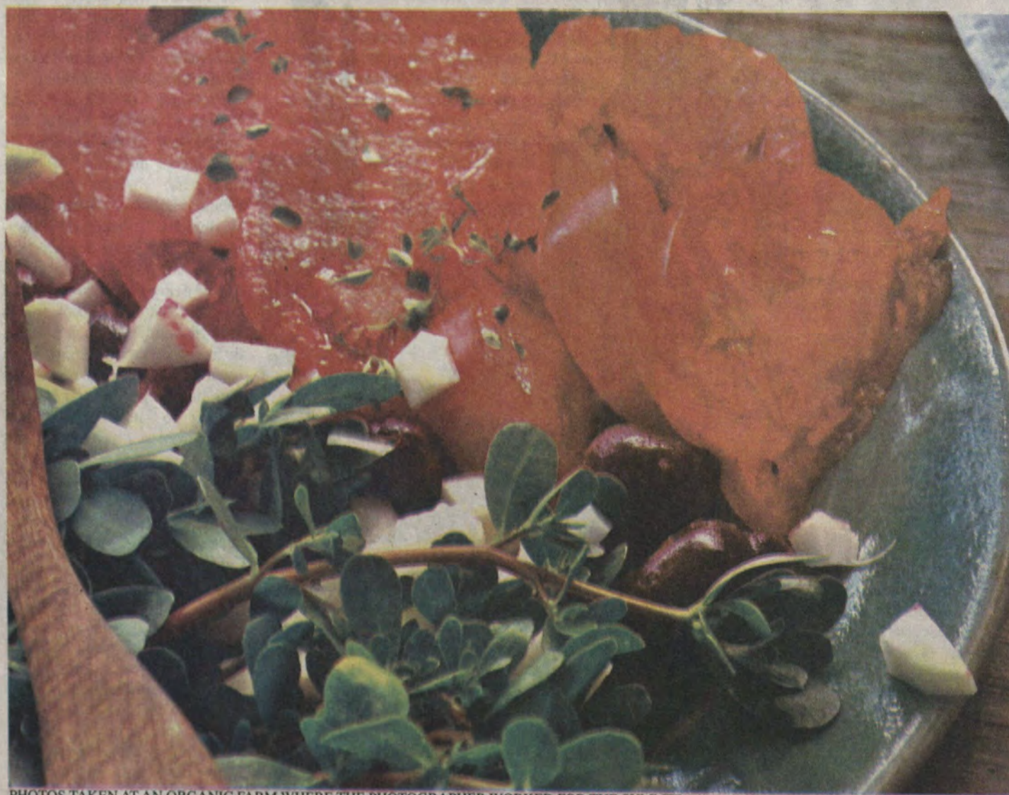
PHOTOS TAKEN AT AN ORGANIC FARM WHERE THE PHOTOGRAPHER WORKED FOR THE SUMMER