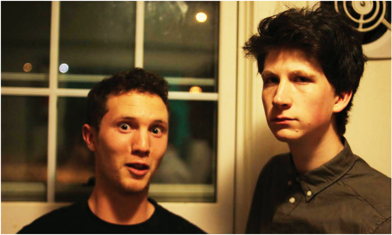
From left: Kadison '17 and Chatigny '18

a coping mechanism can be a "double-edged sword." Though he definitely sees coping through comedy as effective, and something of value, he wonders "whether it's a healthy thing to do." Indeed, it is entirely possible that people use humor as a temporary reprieve from dealing with deeper issues for which they may need more than just a few laughs.