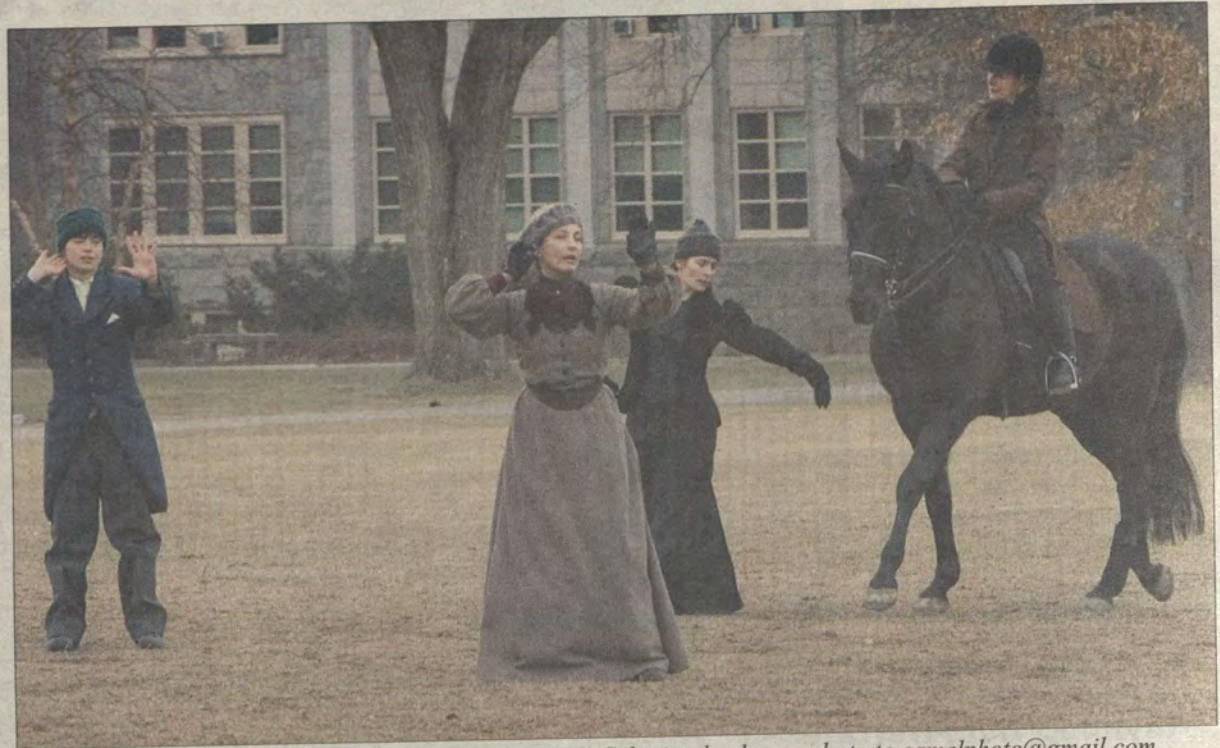
ACDFA Performance on the Green (Green '09) Submit a backpage photo to camelphoto@gmail.com

Cocktails at Conn: Are Our Drinks Too Stiff?, 1941 Room, 7:00 - 9:00 p.m.