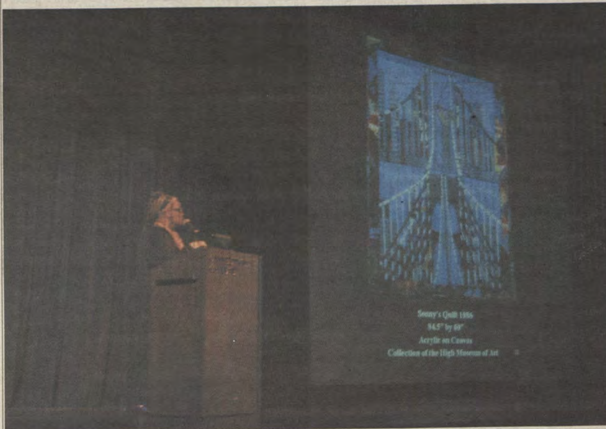
February 13: Faith Ringgold, notable author of children's literature, gave a presentation in Palmer Auditorium commemorating fifty years of her artistic and literary achievements. The presentation was co-sponsored by the Office of Religious and Spiritual Life, the Center for the Comparative Study of Race and Ethnicity, the Black History Month Committee, and the Kente Cultural Center.