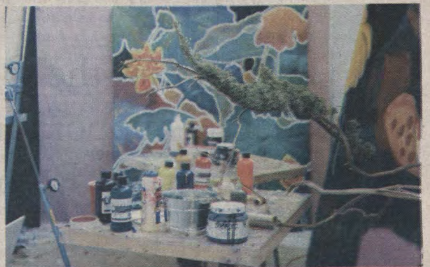
Set-up for spring art shows, including senior thesis exhibits, in Cummings