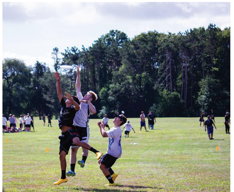
The men's ultimate team