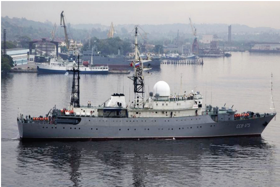
Viktor Leonov near Havana, Cuba (2015)