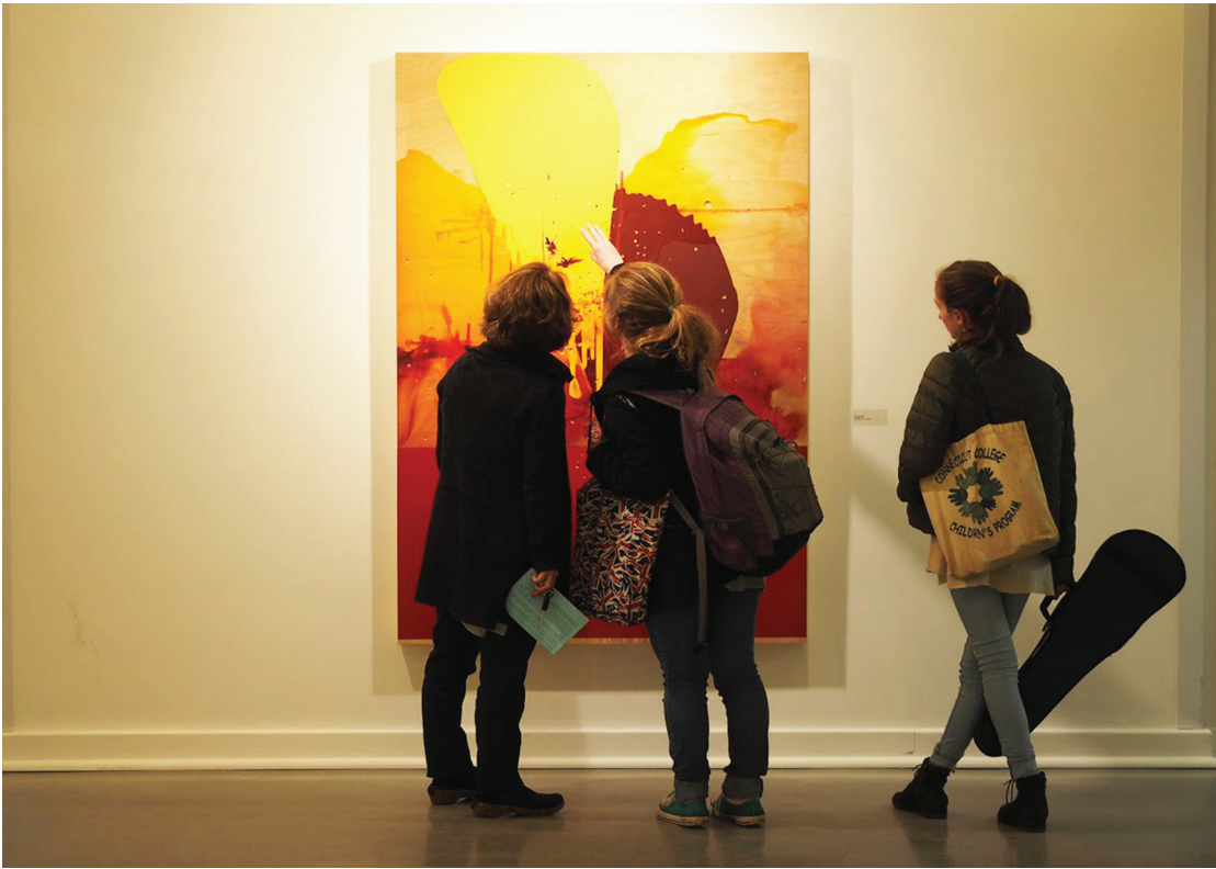
Students examine Depeña’s work

Another project that was detailed during Depeña’s lecture was “Towards a Fading Sign”—a nine by 21-foot display board featuring flip-dot technology, as seen on old-school bedside clocks. The piece is part of the Quantum collection designed for Royal Caribbean Cruise Lines. Printed in blue, Haiku-inspired phrases meant to poetically capture the natural world—such as “water on my skin” and “vastness appears”—surface and wash away on the black screen, some-