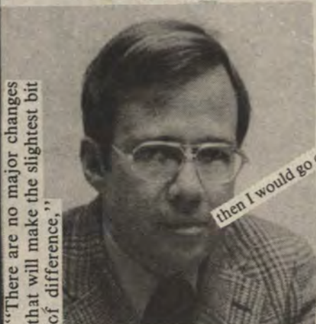
"There are no major changes that will make the slightest bit of difference."

"One change that I am particularly happy about is that we added a procedure and process that would have to be followed before they could cut funding on any club."