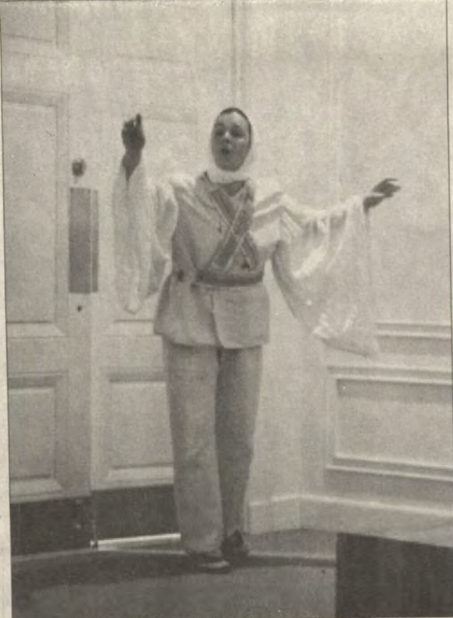
A member of the Yugoslav theater group Dah Teatar. The troupe gave masterclass and performed last week.

Overall, by using theater to promote the strength of the human spirit,