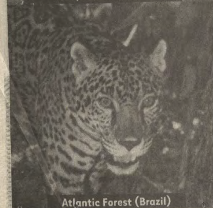
Atlantic Forest (Brazil)