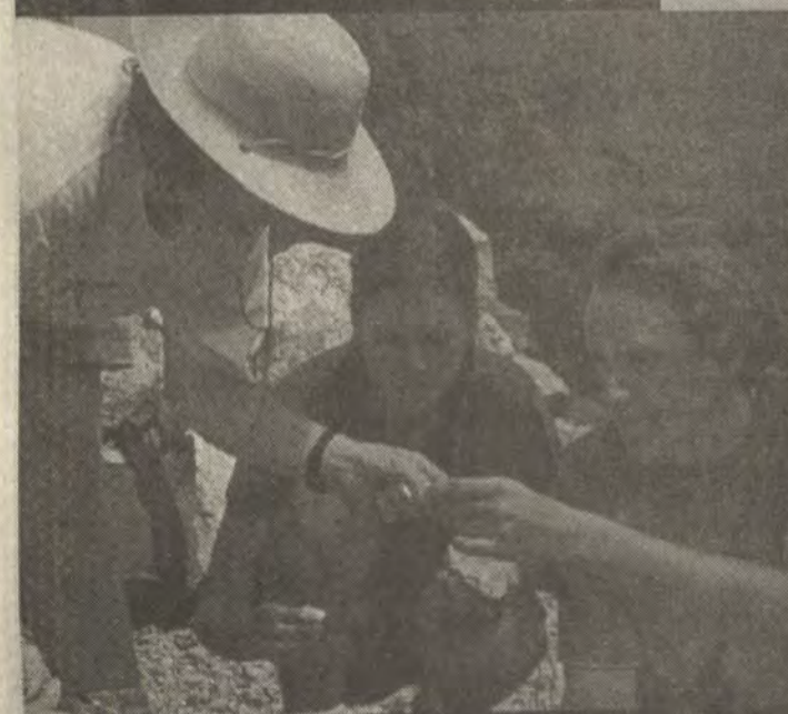
Biosphere 2 Center (AZ)