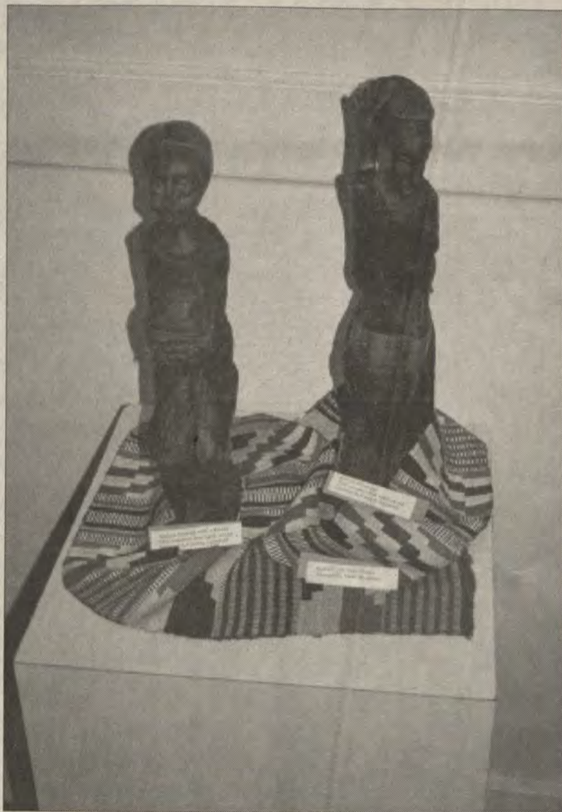
Two sculptures featured in Unity and UMOJA's African Art Exhibit, part of this month's African History Month celebration. (Barber)

The exhibition encompasses many mediums, ranging from oils and watercolors to textiles, wood and soapstone. Masks from different regions of the African continent reflect the traditions still vital to modern African art, a Tinkler Print depicts an