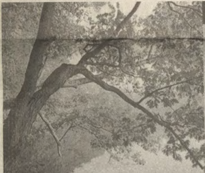
Black Rock Forest (NY)

Learn more about the program and get your application at www.see-u.org Email see-u@cerc.columbia.edu