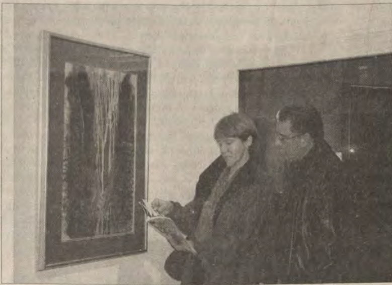
Two New Londoners enjoy one of the many pieces now on display at the Alva Gallery in downtown New London.