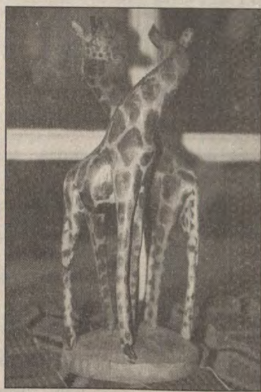
A sculpture on display at Unity House as part of the African Art Exhibit