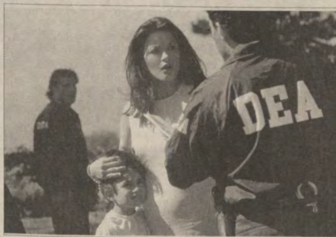
Catherine Zeta-Jones stands in shock as her husband is arrested on drug charges.

the work is handheld - shaky enough to notice, but steady enough to be easy on the eyes. Filmed with tons of close-ups, Traffic plays like a number of intimate conversations between Traffic 's characters.