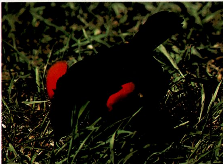
The primary preoccupation of male Red-winged Blackbirds during spring is the defense of a breeding territory. This species is a colonial breeder and is regularly polygynous. Vigorous aggressive displays are costly parental investments, but when successful competitive behavior allows access to multiple females, instead of just one, the potential reproductive payoff is obvious.

Generally birds defend territories only against other individuals of the same species. There are exceptional cases, however, in which the territory is defended against other species. This is often the case with those colonial birds, like weavers and many oceanic birds, in which two or more kinds of birds live in the same colony. In these cases, nest site territories are protected from any intruder, regardless of species. Also, individuals of some species with larger territories defend them against other species that have similar food and nest site requirements. This is the case for the Yellow-headed Blackbirds ( Xanthocephalus xanthocephalus ) and Red-winged Blackbirds ( Agelaius phoeniceus ), two closely related birds that occupy the same marshes in north-central and western North America. Orians and Willson (1964) studied the interactions between these two blackbirds at Turnbull National Wildlife Refuge in Washington. Nearly all of the marshes on the wildlife refuge support both species, and