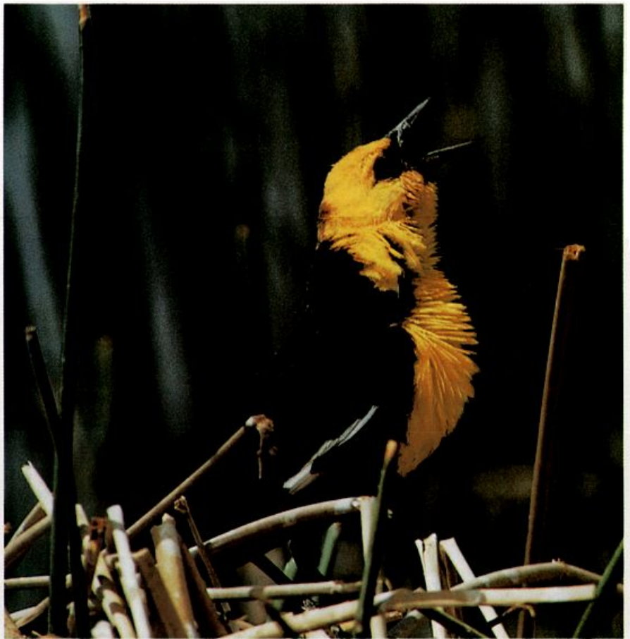
Yellow-headed Blackbird males arrive in a breeding marsh area before females. They evaluate the habitat for food availability and safe nest and roost sites, commit to a specific patch for an entire season, and thereafter invest heavily in defense of that territory. Because these decisions have been made independent of the presence of females, when they arrive, they are in a position to assess the quality or fitness of a male and his patch of real estate and to then choose a mate. Males make habitat decisions while for females, selecting a mate is equivalent to making a territory decision.