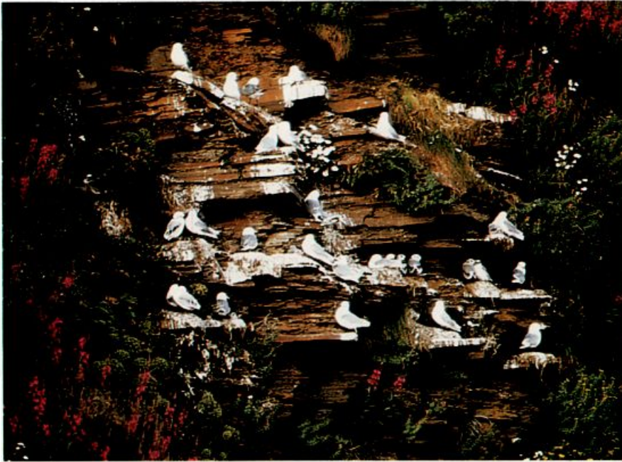
Black-legged Kittiwakes nest in colonies sometimes so large as to defy credibility. This species is very site tenacious with territorial behavior probably limited to the nest site. Displays are still imperfectly understood, but defense of the nest site and the small area surrounding it often becomes extremely aggressive.

in every case they have mutually exclusive territories. Red-winged establish their territories in March, before the Yellow-headed have returned from the south, and Red-winged territories initially cover the entire marsh. In April the larger Yellow-headed arrive and drive the Red-winged from the parts of the marsh with deep water and sparse vegetation (usually the center). The Red-winged typically retain territories only on the periphery of the marsh. In Washington State, Yellow-headed are dependent on emerging damselflies to feed their young, and these are most abundant in the more open areas of the marsh (Orians 1980). Red-winged, however, can feed their young a great variety of insects, and they nest successfully on the edge of the marsh or even in upland areas. The two species use the same threat displays and songs against one another that they would to defend their territories against members of their own species.