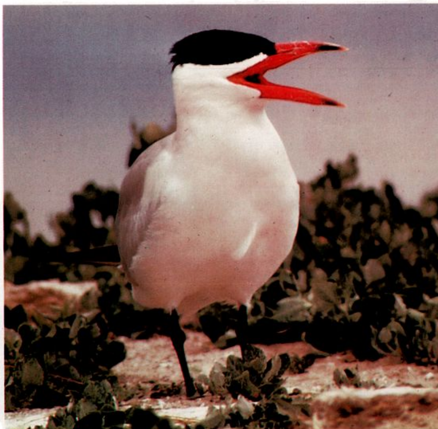
Caspian Terns are highly gregarious, assembling to breed, feed and boldly mob predators. They are unusually vocal with harsh, clipped cries serving aggression, advertisement of territory, and maintenance of contact between parent and young. Nest sites are small and closely spaced. When adults in dense colonies actively defend these sites, pairs with small territories may suffer minimal predation because closely packed adults together form an extremely effective means of defense.