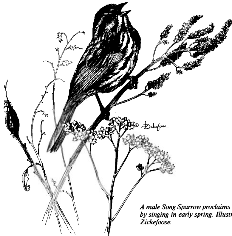
A male Song Sparrow proclaims its territory by singing in early spring.