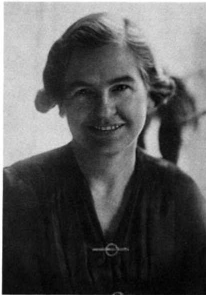
An early photo of Margaret Morse Nice taken in Chicago, circa 1920. With no formal ornithological training, she made significant contributions to the field.

The two-volume work, Studies in the Life History of the Song Sparrow (Nice