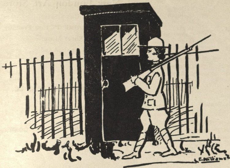
A Mere Suggestion for a Summer Job at College.