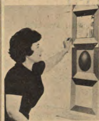
Miriam Schapiro, Tamarind artist-fellow July-August 1964, looking at one of her lithographs, "The Shrine."

Miss Miriam Schapiro will be Visiting Critic to the department of art this semester.