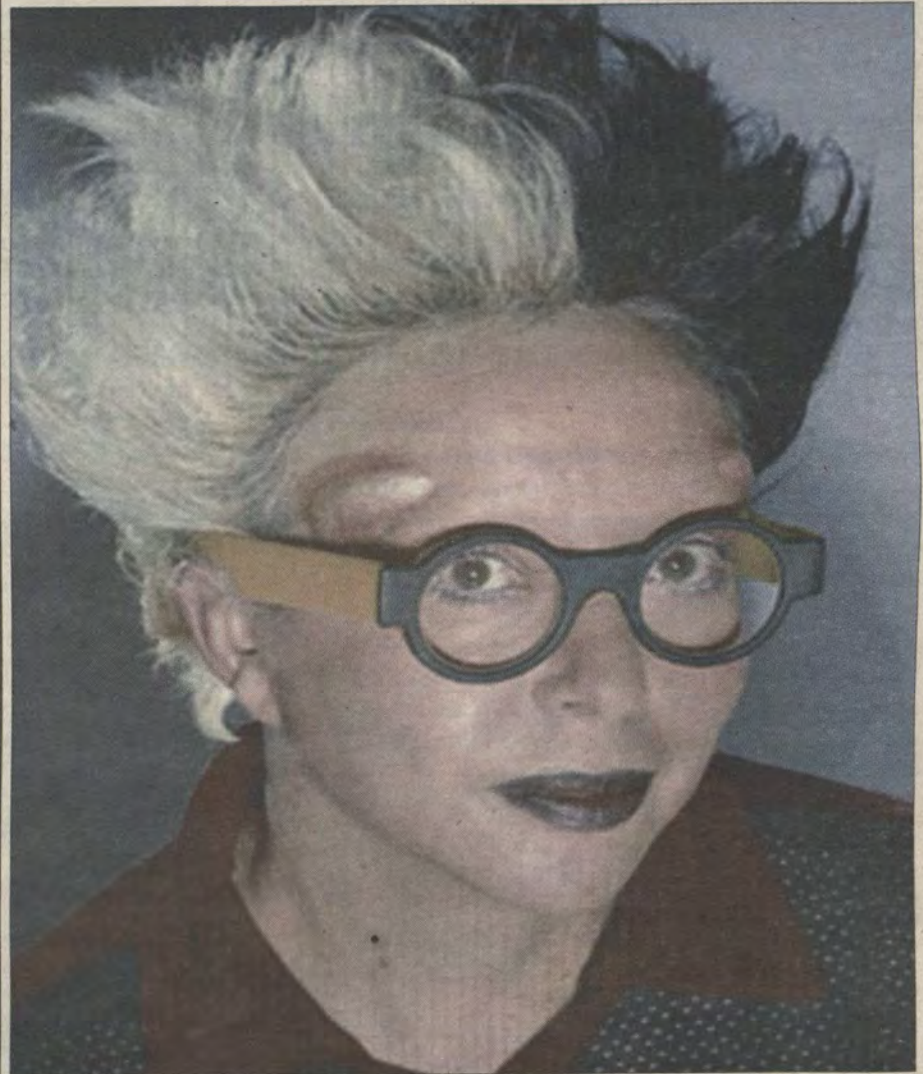
Orlan spoke to Connecticut College students on Tuesday, March April 1st

The College is scheduled to host a number of prominent guest speakers, engaging faculty book talks and stimulating panel discussions during the month of April. One of the most extraordinary, the lecture by Orlan, an international performer and visual artist who uses her own body and the procedures of plastic surgery to make "carnal art," was one of the most popular lectures of the year.