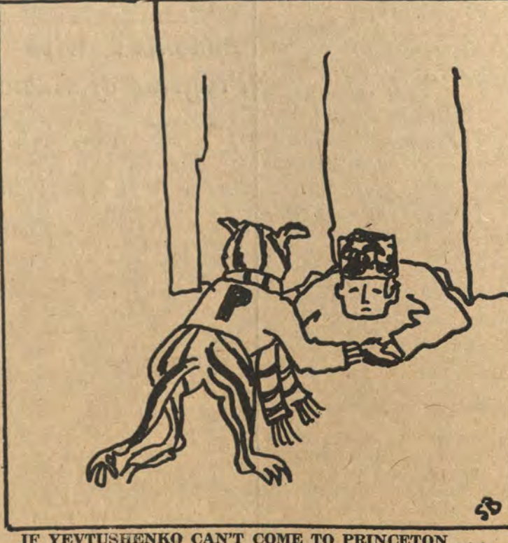
IF YEVTUSHENKO CAN'T COME TO PRINCETON...

Registration for RESPONSE will be $2 for students and $5 for adults. Room accommodations will be $8 and tickets for the Dave Brubeck Concert will be $3.90 and $2.90. Checks should be sent to RESPONSE, 201 Nassau Hall, Princeton University, Princeton, New Jersey and should be made payable to McCarter Theatre.