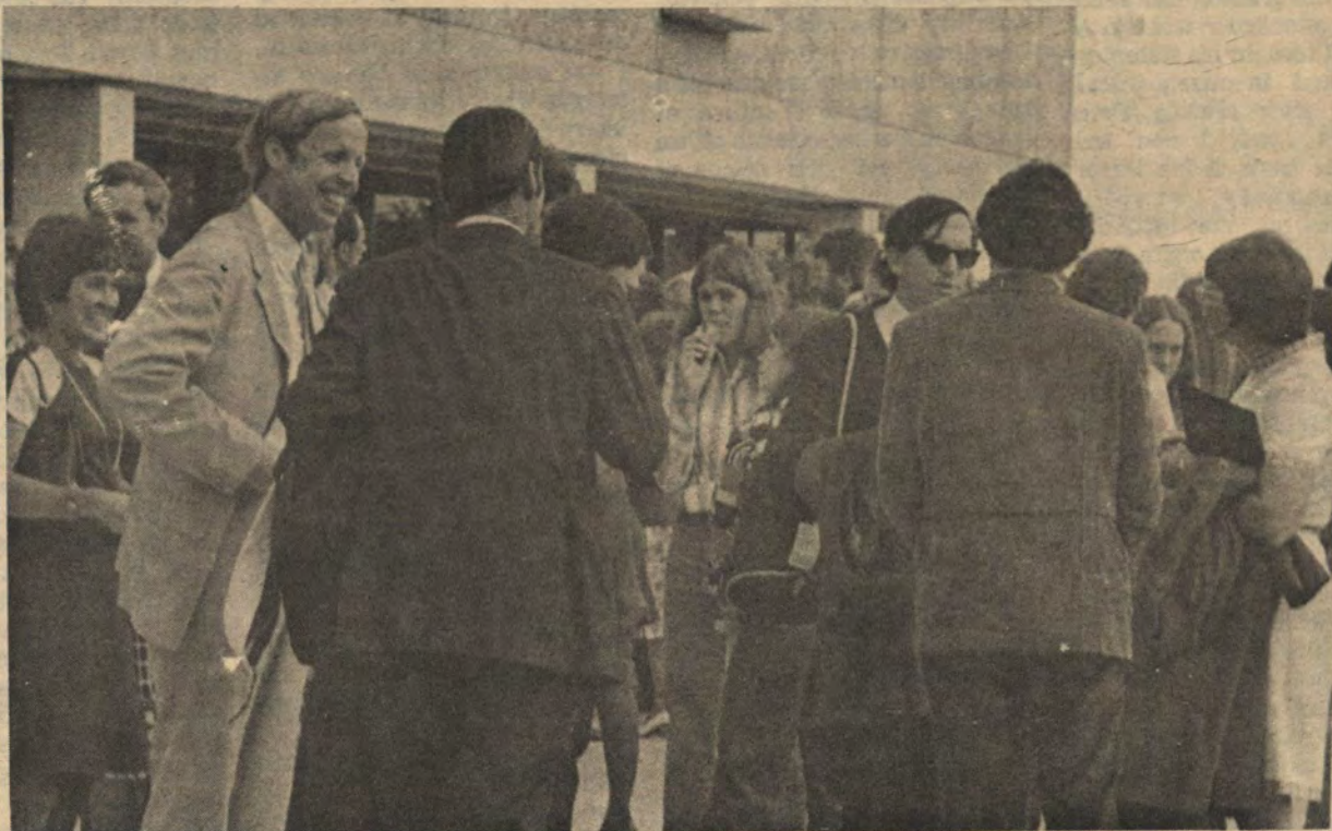
Cummings terrace, where the elite meet.