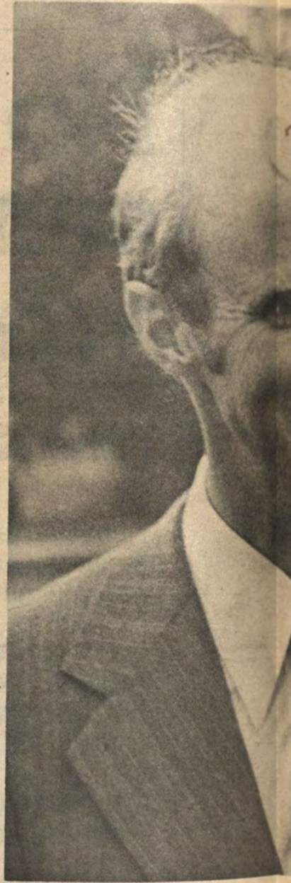
Into the Breach: Pre