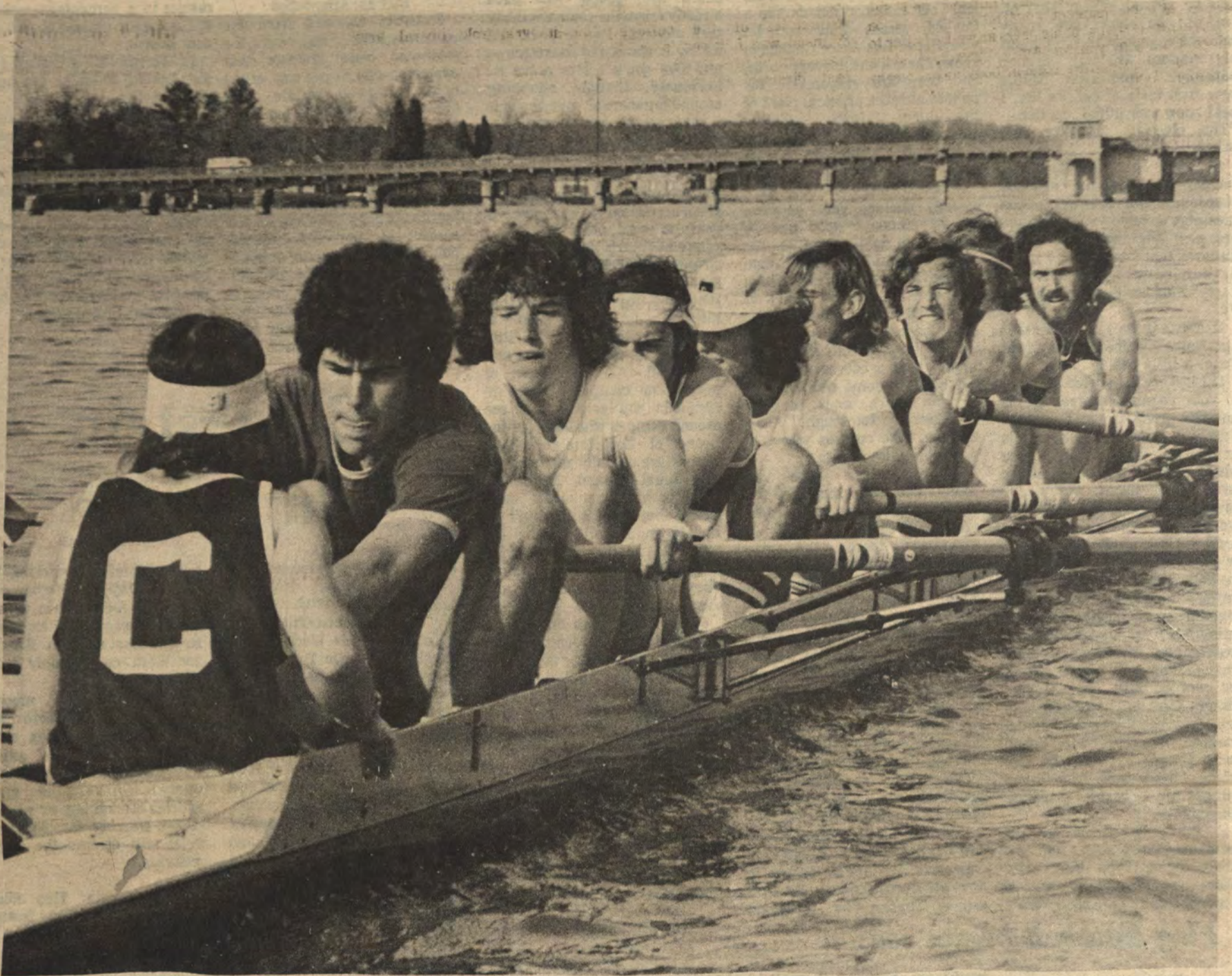
The Men's Heavyweight eight getting it on