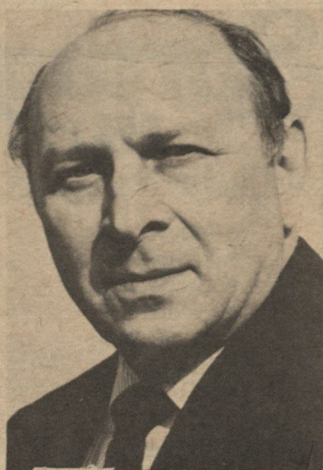
Shakespearean actor Morris Carnovsky

GROTON SHOPPERS MART Between Bonanza & Reid & Hughes PHONE 445-5151