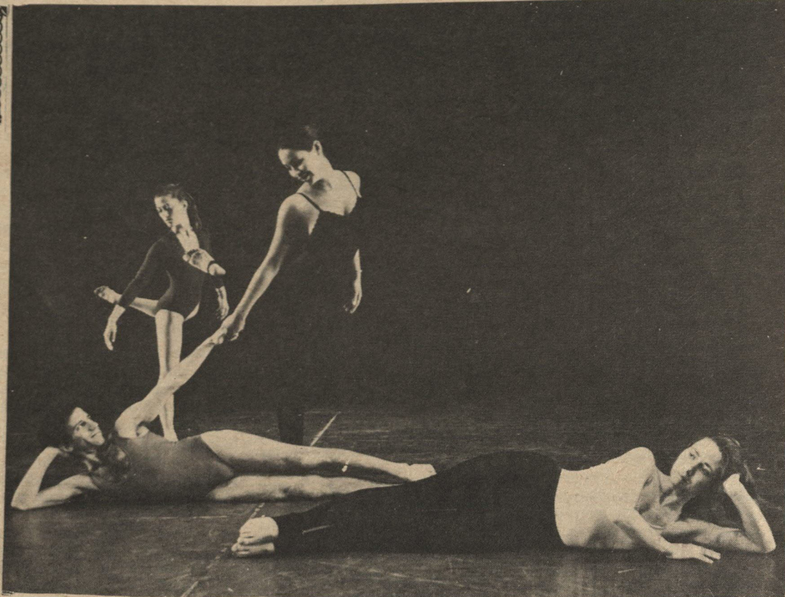
The Connecticut College dance department is presenting a "Spring Dance Sampler", choreographed by faculty and performed by faculty and students Wednesday and Thursday (April 13 and 14) at 8 p.m. in Palmer Auditorium.

And there you have it: a look at the days of theater when shows and audiences were noted for their own stunning performances.