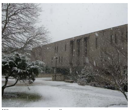
Winter snowstorm at the college.