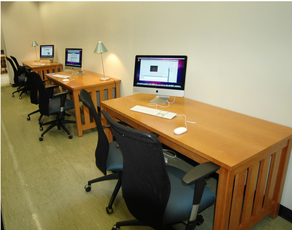
New computer area on the second floor of the Shain Library.

The combined installation of compact shelving and shifts in the collections provides us with 12-15 years of growth space for new collections.