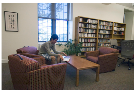
Lounge area in the Language Center.