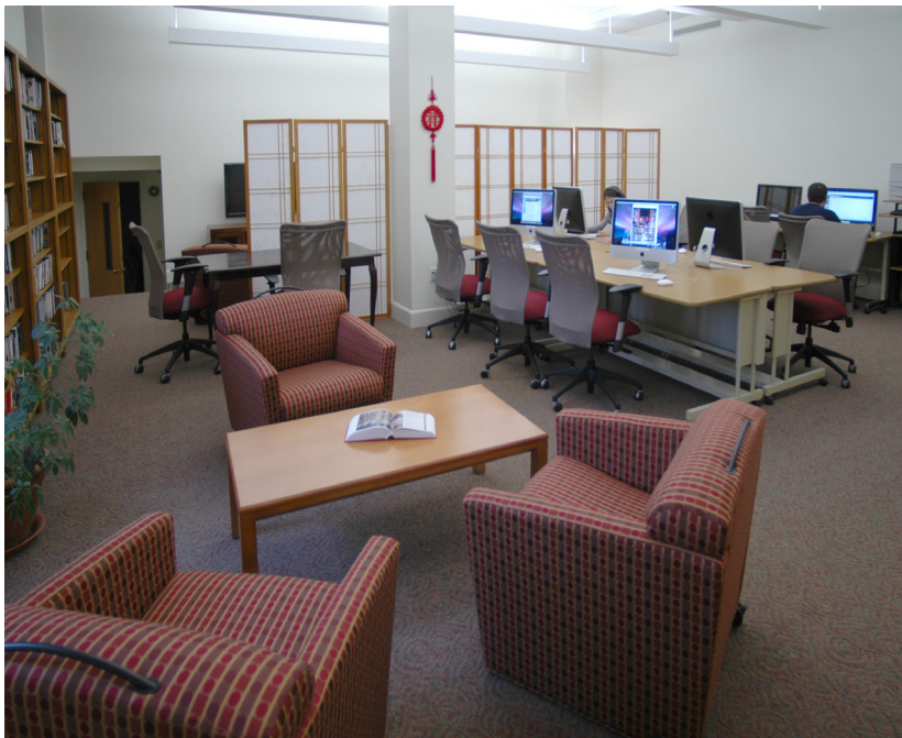
Lounge and collaborative study area.

The Language and Culture Center is for students—within and outside courses, between classes and after classes. Its focus is on the integration of foreign languages and cultures into the curriculum. The Center is also home to Information Services' Digital Enhanced Learning Initiative (DELI) program for the foreign languages. Through DELI, iPods loaded with academic and cultural materials are distributed to students in particularly challenging language courses, such as Russian, Chinese and Japanese. Edie Furniss, whose office is within the Center, manages the facility and its activities. Edie recently joined the college, after completing her MA in Teaching a Foreign Language (Russian) and Certificate in Computer-Assisted Language Learning from the Monterey Institute of International Studies (see her profile on page 7). Please stop by to visit Edie and get a tour of the new Language and Culture Center.