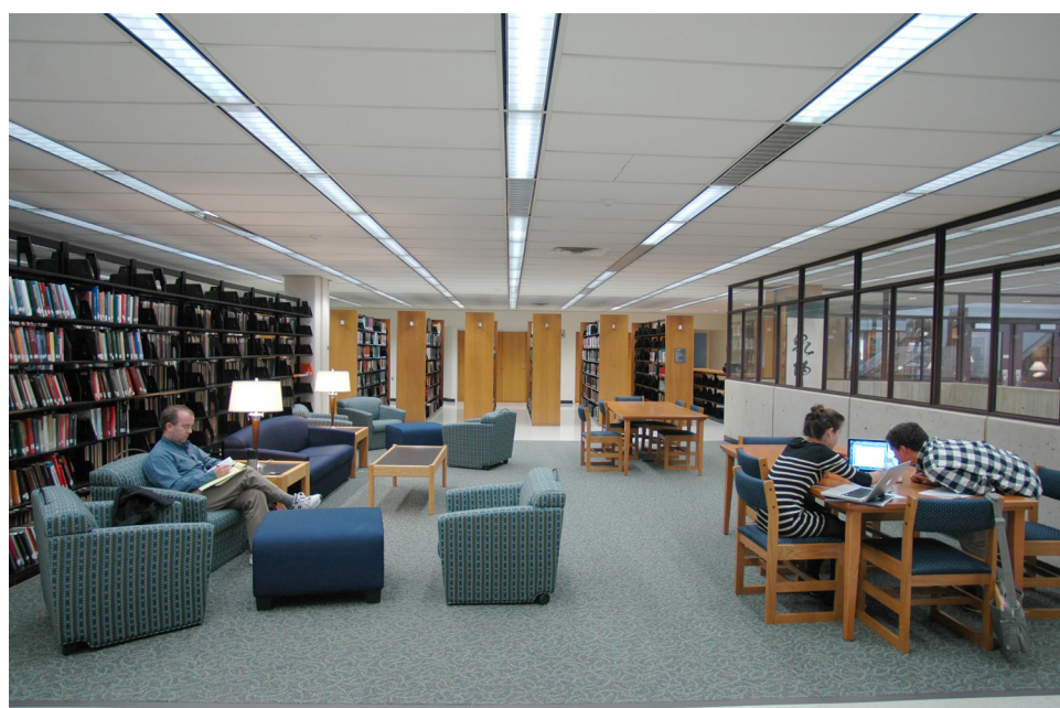
Updated study space on the second floor of the Shain Library.