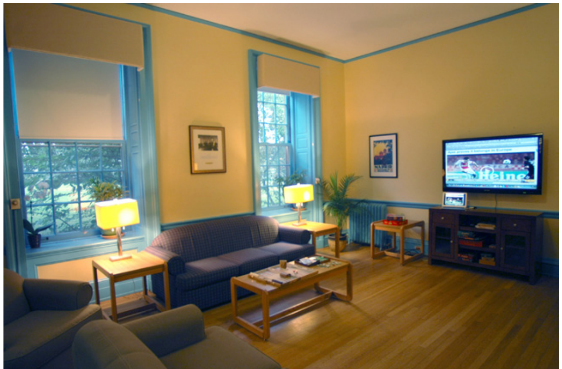
Lounge area in Knowlton.