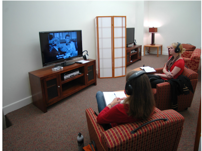
Media viewing area.

tions to international resources through Skype and other software. The former audio booth where faculty recorded lessons has been modernized. We also converted a storage