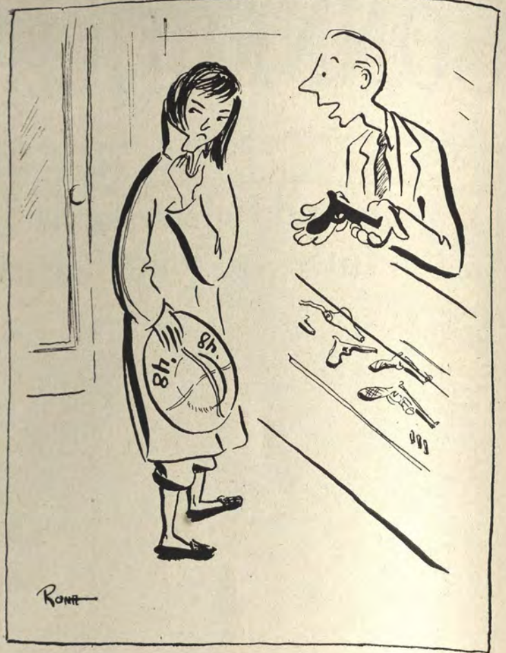
You Say You'll Know If You Want It by May 28?