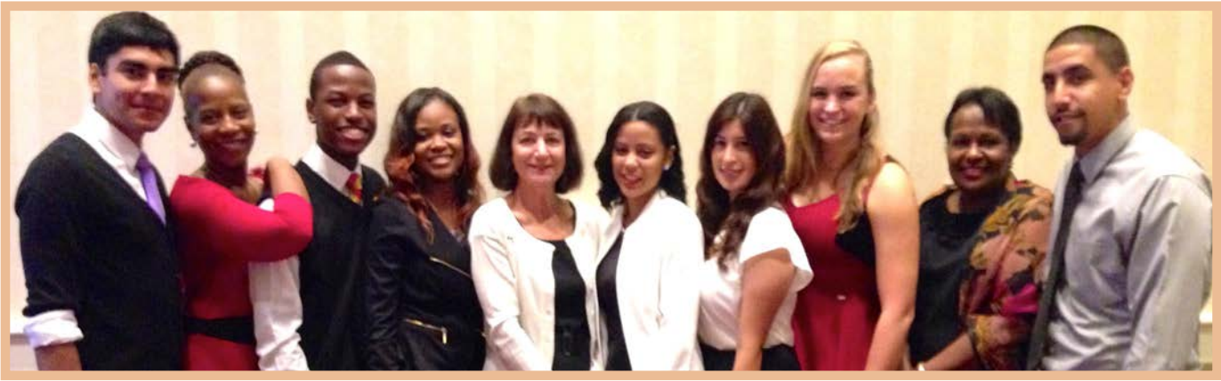
Connecticut College staff and students support the Dr. King Scholarship Fund